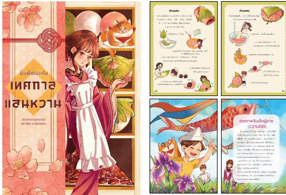
Figure 3 : Book cover and layout Completed work Illustrated book: Sweet Festival was prepared from the concept

Step 3 cover design in the form of a female employee sliding the lid of a candy box to give the impression of welcoming people into the store. The background is candy squares with candy in each square. The font chosen is a font called "MN Dorayaki". As for the content of the book, The content font has been chosen according to the opinions of experts, selected from the questionnaire, including the font Mali (Mali), size 16 points and the headline font named FC Lamoon (FC Lamoon), size 24 points.