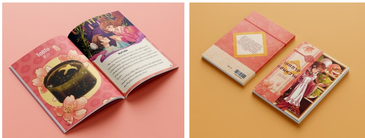
sweet hidden box. Figure 4 : Illustrated Book Design : Recording the Story of Japanese Sweets Festival.