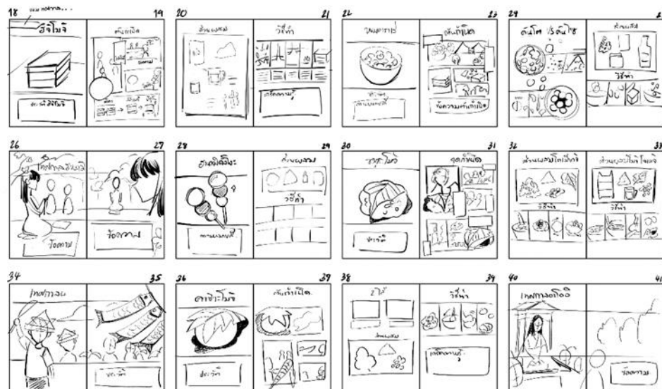
Figure 2 : Outline of book formatting.

Step 2 in making a draft of book formatting. Many styles of painting were experimented with. The first type specifies the details of the book, such as the layout of the book. Using the frame of a square and the manga channel determines the layout of illustrations and topics. and areas that provide knowledge to make it look organized and easy to understand.