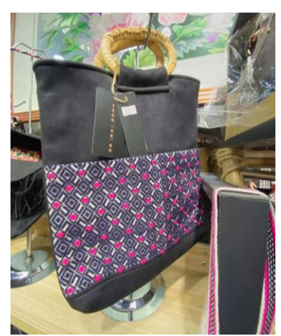
Figure 5 Cultural and creative products of Yao Cultural Experience Museum in Hezhou, Guangxi

Experiential tourism has become an important way to promote regional development, in which traditional handicraft and experiential experience show a greater correlation. Through the innovative design of traditional culture, people have more ways to understand traditional culture and more comprehensive information. The unique local cultural resources will be used to build the Guangxi Gaoshan Yaoyao Embroidery traditional cultural creative industry Park, which will deeply dig and organize the historical and cultural heritage, and build a folk culture museum and traditional handicraft workshop in the park, providing tourists with the opportunity to personally experience the production of traditional handmade products and have a deep and comprehensive understanding of intangible cultural heritage through personal experience. Tourists can take their travel experience home as souvenirs, realize resource sharing and benefit reciprocity, and promote the common development and prosperity of the surrounding tourist attractions through network communication and other ways. These measures can promote the development of regional tourism and cultural industries, and promote the inheritance and development of traditional handicrafts.