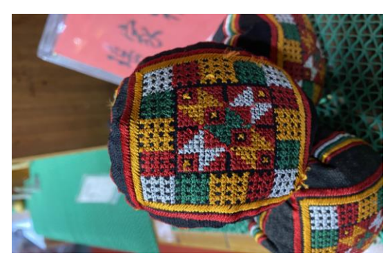
Figure 4 Cultural and creative products of Yao Cultural Experience Museum in Hezhou, Guangxi

more people's attention. Through these measures, we can better protect and inherit Guangxi's traditional intangible cultural heritage and promote its development.