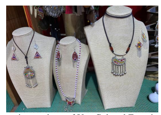
Figure 3 Cultural and creative products of Yao Cultural Experience Museum in Hezhou, Guangxi

Attaching importance to traditional handicrafts and supporting the training and development of inheritors can promote the diversity, sustainability and innovation of intangible cultural heritage. Governments should take measures to encourage young people's participation, provide technical support and training institutions, and enhance their social status and influence by rewarding and recognizing inheritors. At the same time, the government can enhance the market value and awareness of traditional handicrafts and attract more people to participate in promoting their development. Attaching importance to the protection and inheritance of intangible cultural heritage is conducive to the development and prosperity of Chinese culture.