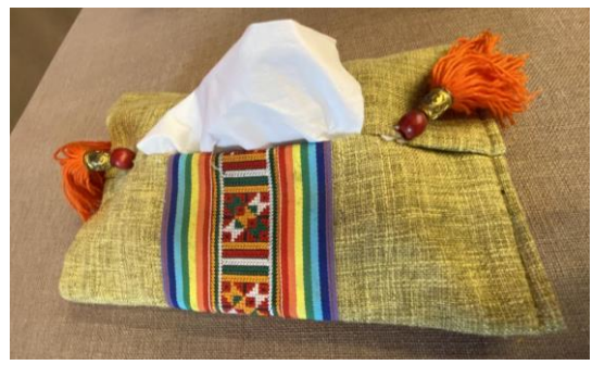
Figure 2 Cultural and creative products of Yao Cultural Experience Museum in Hezhou, Guangxi