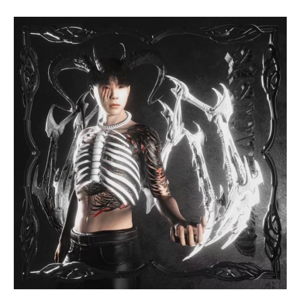
Figure 1:I SASIOVERLXRD "CHENG DAOLIANG" <a href="https://music.163.com">https://music.163.com</a>