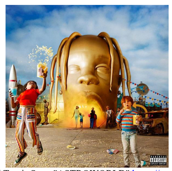
Figure 2: I Travis Scott "ASTROWORLD" <a href="https://music.163.com">https://music.163.com</a>