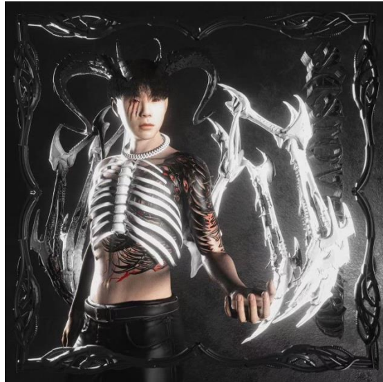
Figure 1: SASIOVERLXRD "CHENG DAOLIANG" https://music.163.com