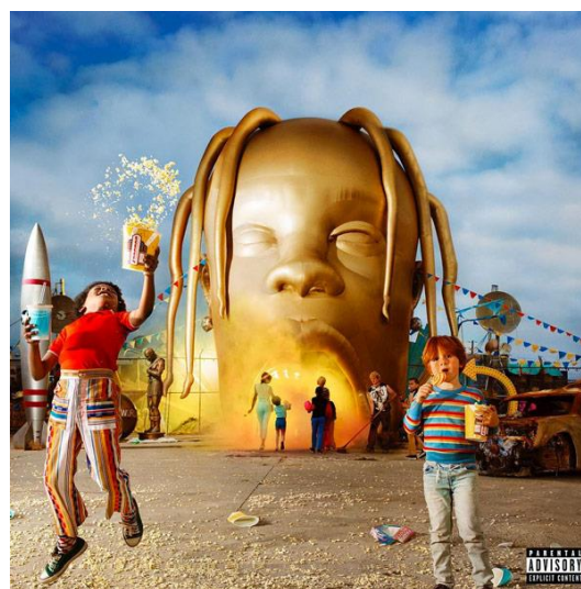
Figure 2 : I Travis Scott "ASTROWORLD" https://music.163.com