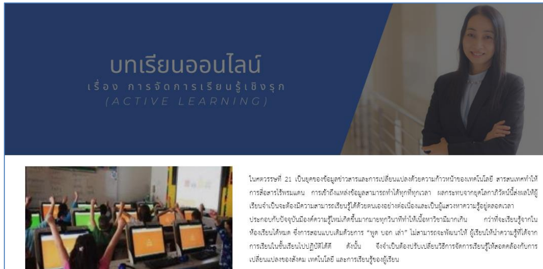
Figure 3 shows the main page of online lessons on the topic of Active Learning.

The research instruments consist of 1) the active learning management plan with online lessons, 2) learning achievement tests (pretest and posttest), and 3) an ability assessment form.