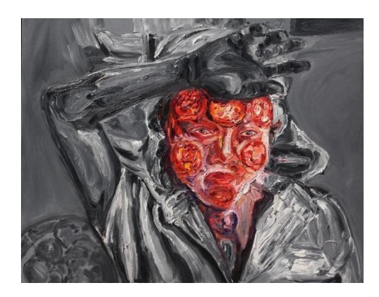
Figure 3 The Painting titled "The season of beauty 1", "The season of beauty 2", and "The season of beauty 3"

Source: Natsuree Techawiriyataweesin (2022)