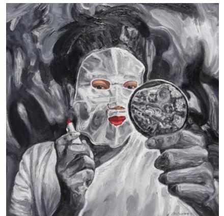
Figure 2 The Painting titled "Black mask 1", "Beneath the mask", and "Makeup Me"