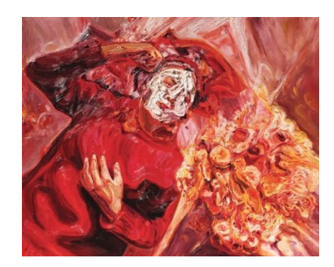
Figure 8 "in the state of chrysalis 1" and "in the state of chrysalis 2"