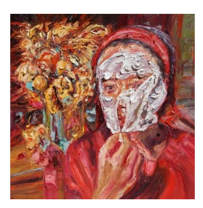
Figure 7 "the innovation of molting 1" and "the innovation of molting 2"