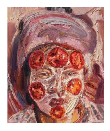
Figure 4 The Painting titled "The season of beauty 4" and "Tomato" Source: Natsuree Techawiriyataweesin (2022)