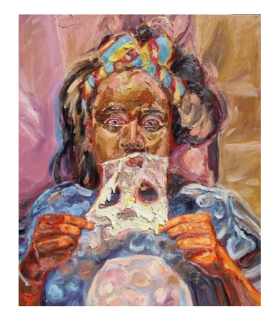
Figure 5 "hidden in the chrysalis 1" and "hidden in the chrysalis 2"