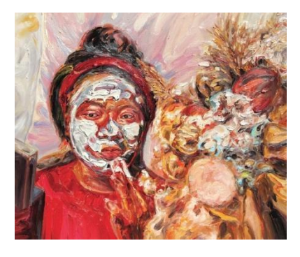
Figure 6 "before becoming a butterfly 1" and "before becoming a butterfly 2"