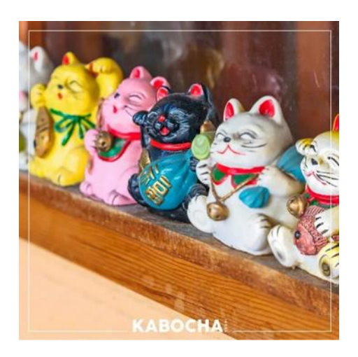
Figure 1 Maneki Neko or Money Cat

good fortune. The woman made a clay cat sculpture, and it was sold successfully. She was able to save enough money as a result to re-adopt the cat (Alys R. Yablon, 2009)