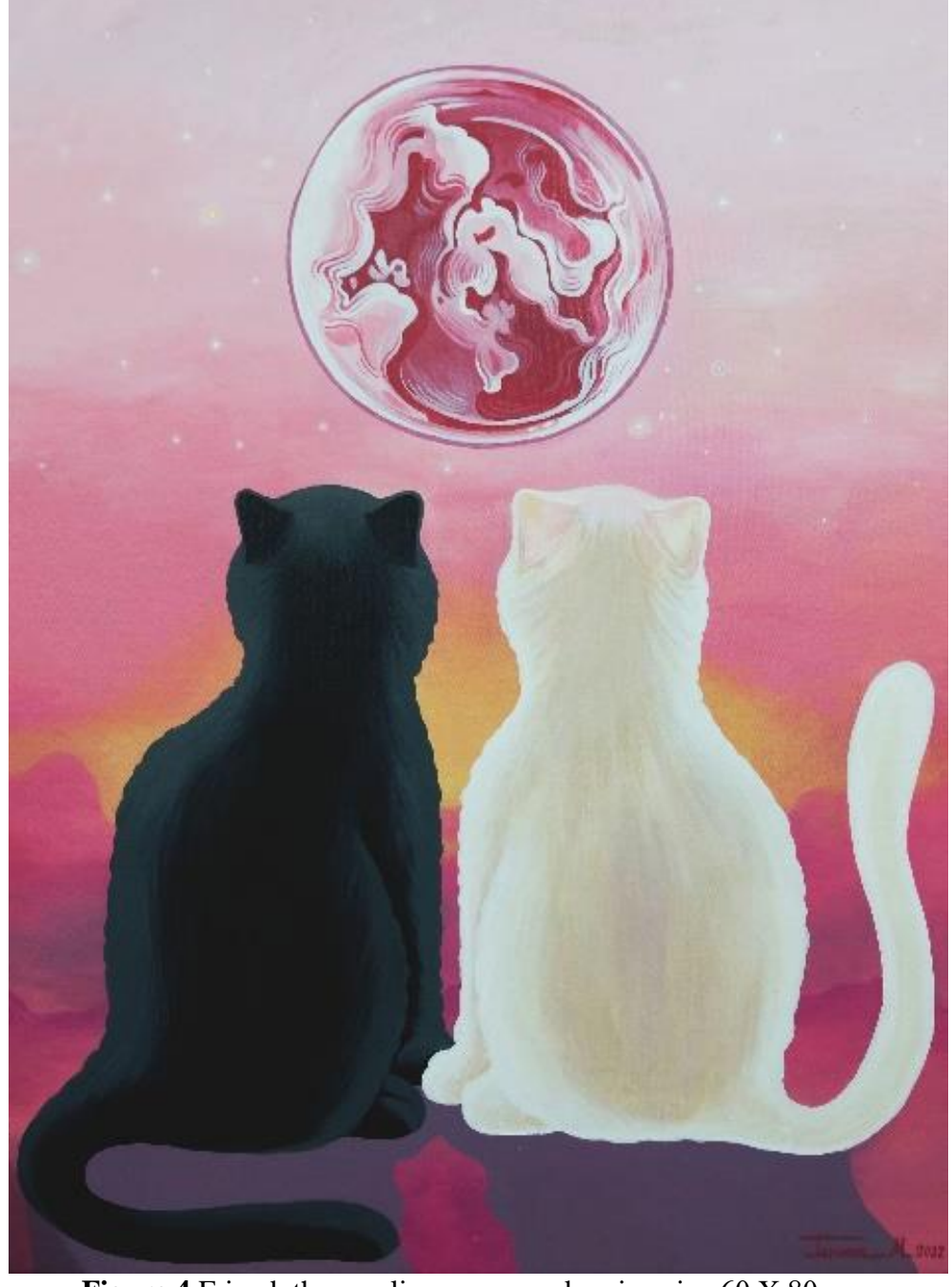
Figure 4 Friend, the acrylic on canvas drawing size 60 X 80 cm.