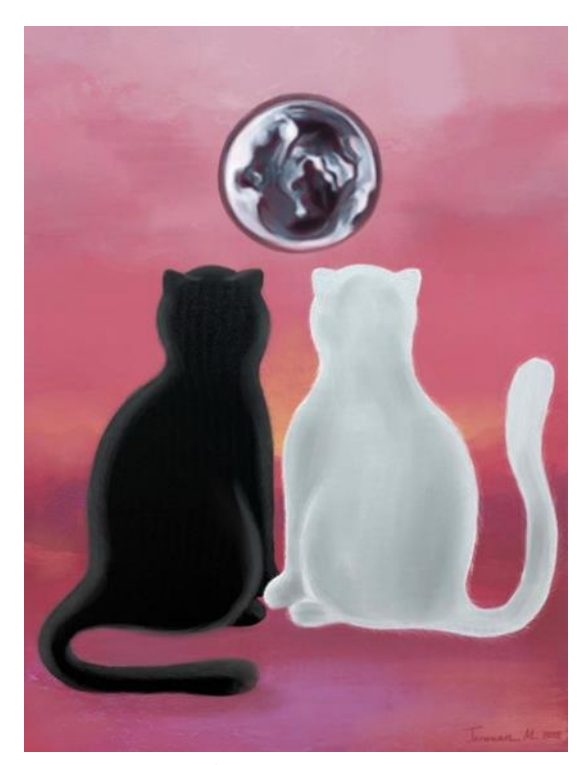
Figure 2 Sketch