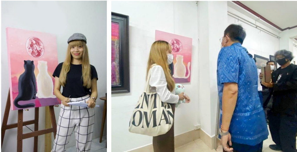
Figure 5 Thai – Lao Contemporary Arts Exhibition. at National Institute of Fine Arts from 25 th July to 31 st August 2022