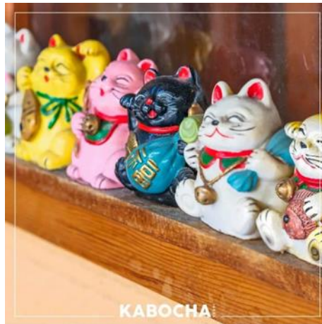
Figure 1 Maneki Neko or Money Cat