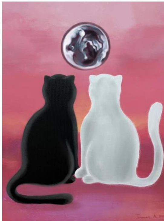
Figure 2 Sketch