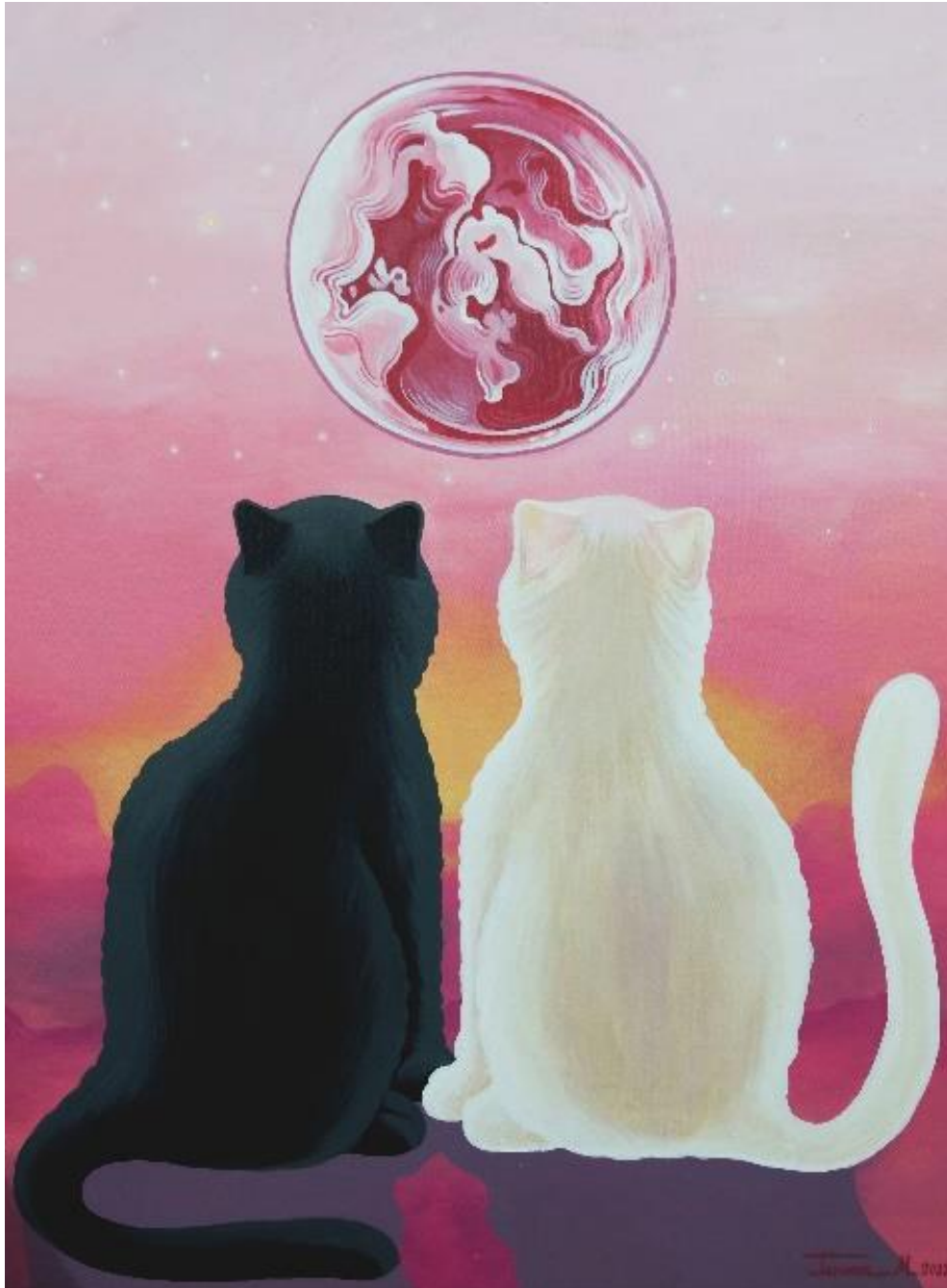
Figure 4 Friend, the acrylic on canvas drawing size 60 X 80 cm.