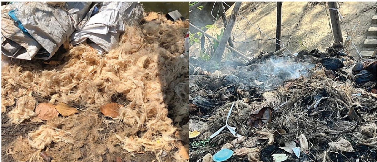
Figure 2 Burning and landfilling of Borassus fruit fiber