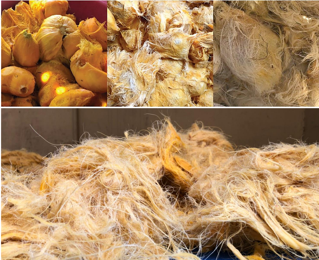
Figure 1 Borassus fruit fiber waste