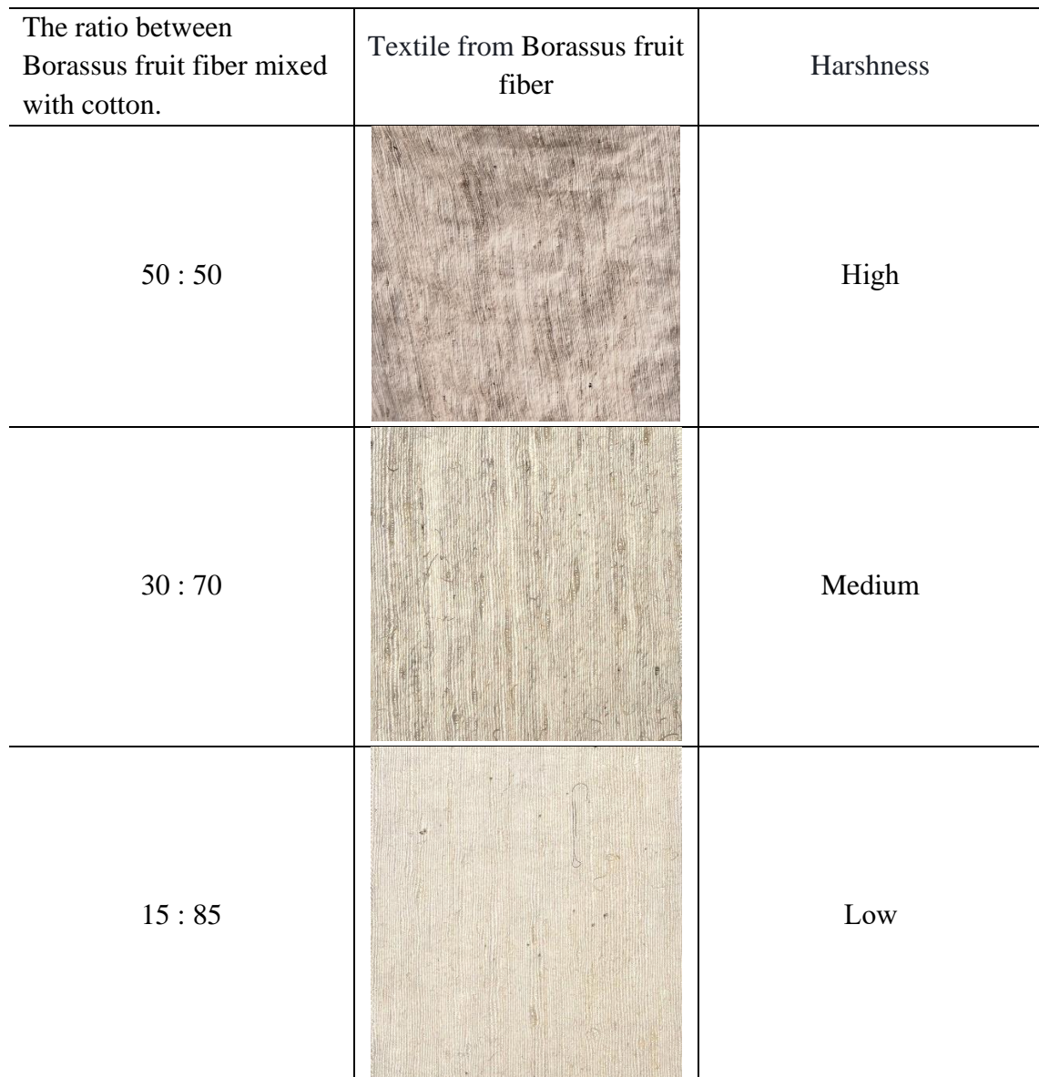
Table 1 : Summarize the experimental results of textile hardness from the ratio between Borassus fruit fiber mixed with cotton.