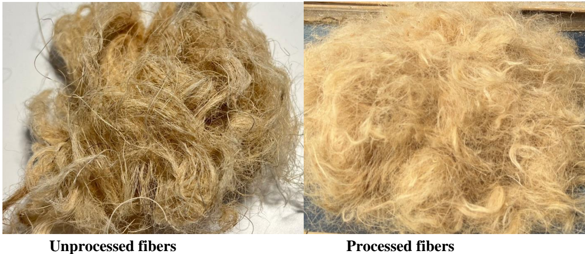
Figure 4 Difference of Borassus fruit fibers

As Borassus fruit fiber undergoes 6 processes, it is fluffier than unprocessed fiber.