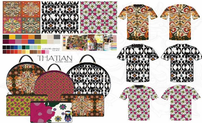
Figure 5 : Design and Creation of Lifestyle and Fashion Products from Patterns of Printed Fabric and Textile obtained from Studying on Art Works and Lifestyle of Tha Tien Community based on the Concept of Creative Economy for Promoting Tourism