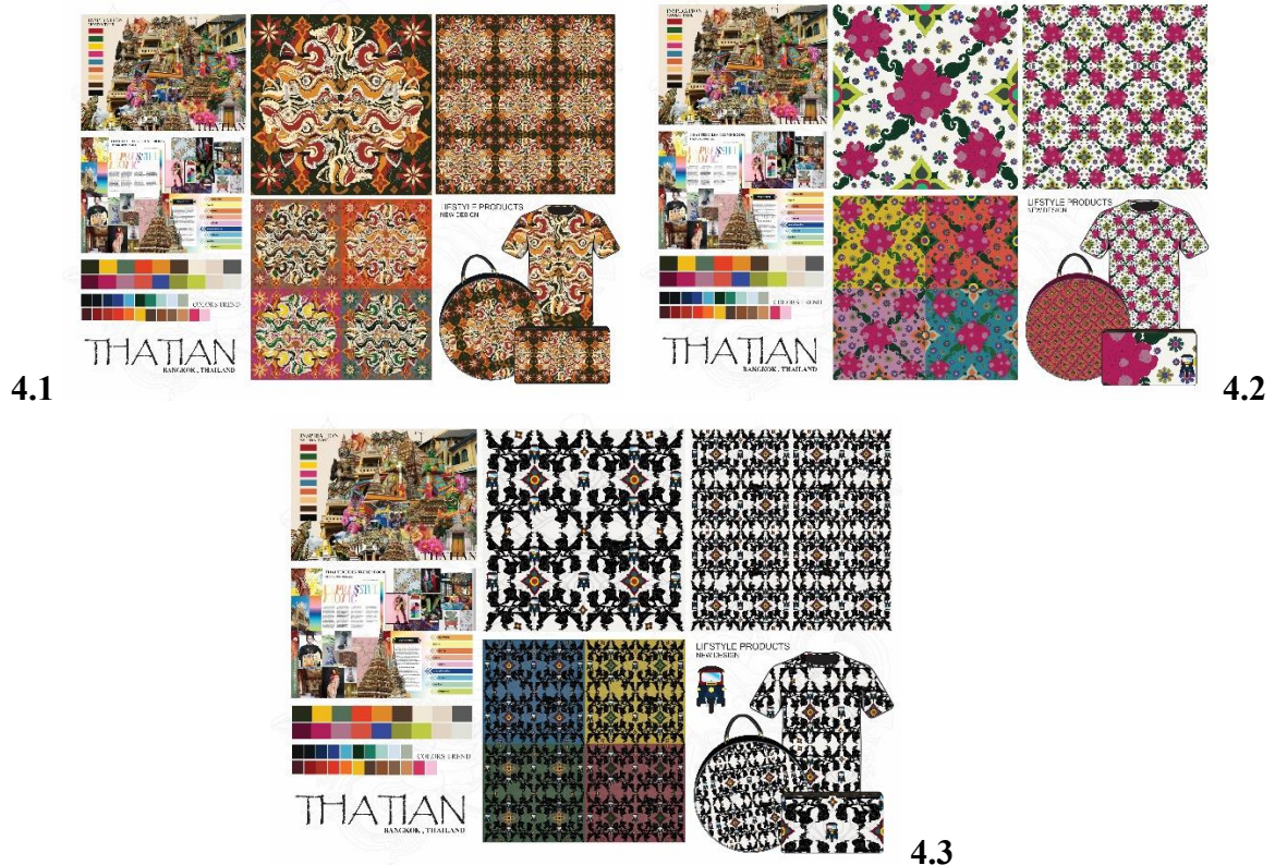
Figure 4 : Pattern design and creation of printed fabric and textile from studying on art works and lifestyle of Tha Tien Community in Bangkok. 4.1. First pattern of Tha Tien printed fabric; 4.2. Second pattern of Tha Tien printed fabric; 4.3. Third pattern of Tha Tien printed fabric.