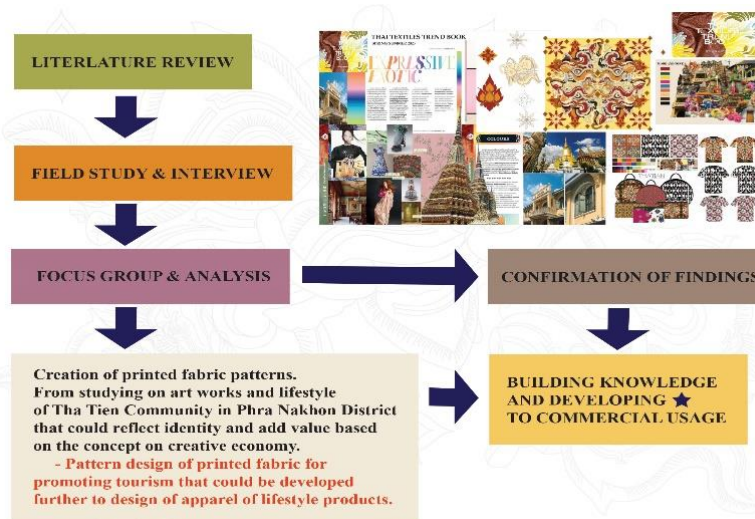
Figure 1. Conceptual Framework, created by Suwit Sadsunk