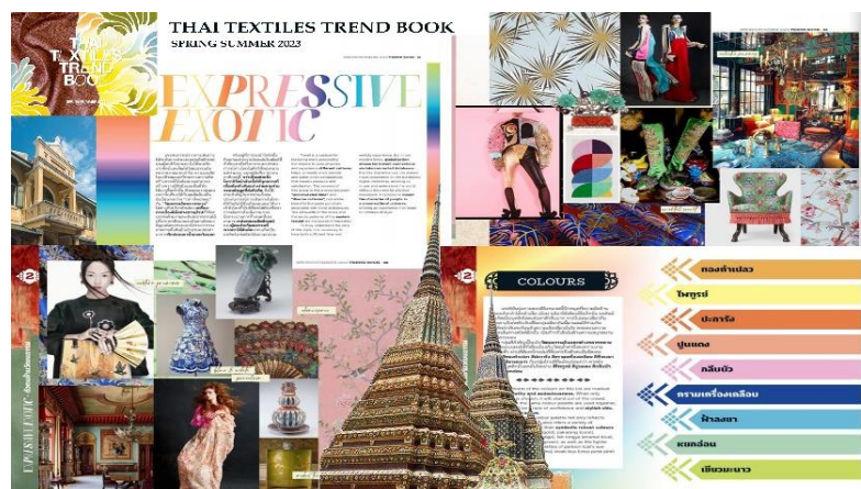
Figure 3 : Trend Spring/Summer 2023(Thai textiles trend book : Expressive exotic )