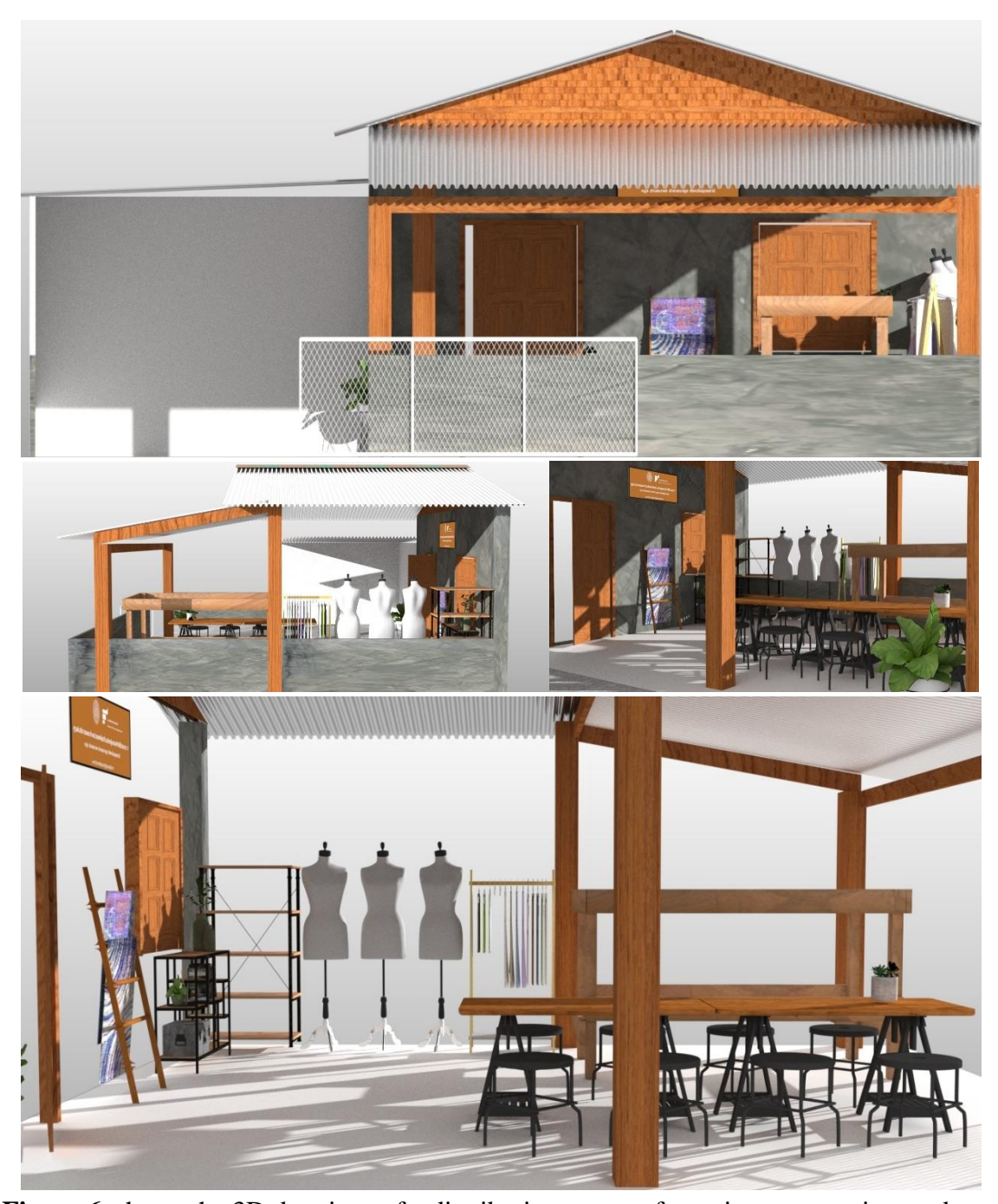
Figure 6. shows the 3D drawings of a distribution center of creative community products.