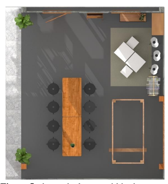
Figure 5. shows the layout within the center.