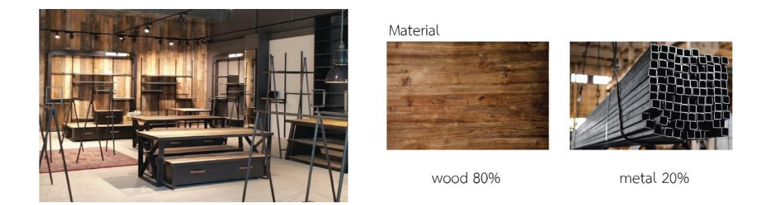
Figure 3. shows material characteristics used in the design of a distribution center of creative community products.

2. Modeling a distribution center of creative community products by using threedimensional programs