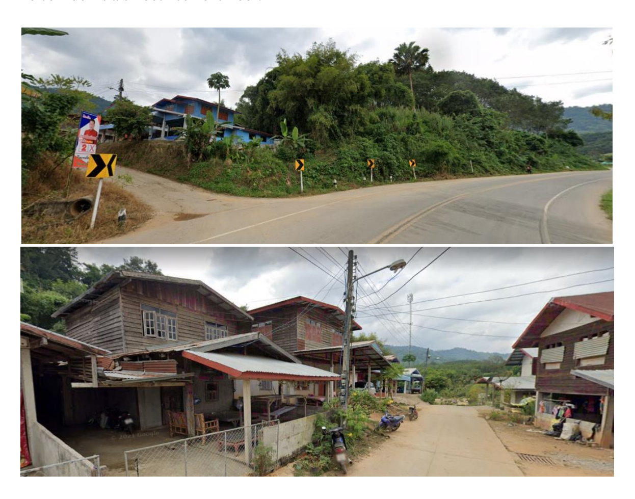
Figure 2. shows Khiri Wongkot weaving group 1 surrounding area.