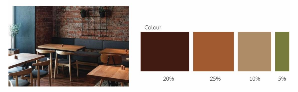
Figure 4. shows the proportion of colors used in the design of a distribution center of creative community products.