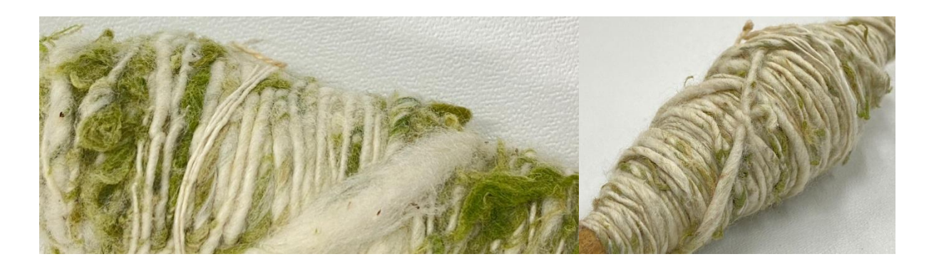
Figure 5 shows the algae fibers spun with cotton

2.2 The experiment of weaving algae fibers with cotton fibers in 3 ratios, 30:70, 50:50, 70:30, which can be summarized as Table 2.