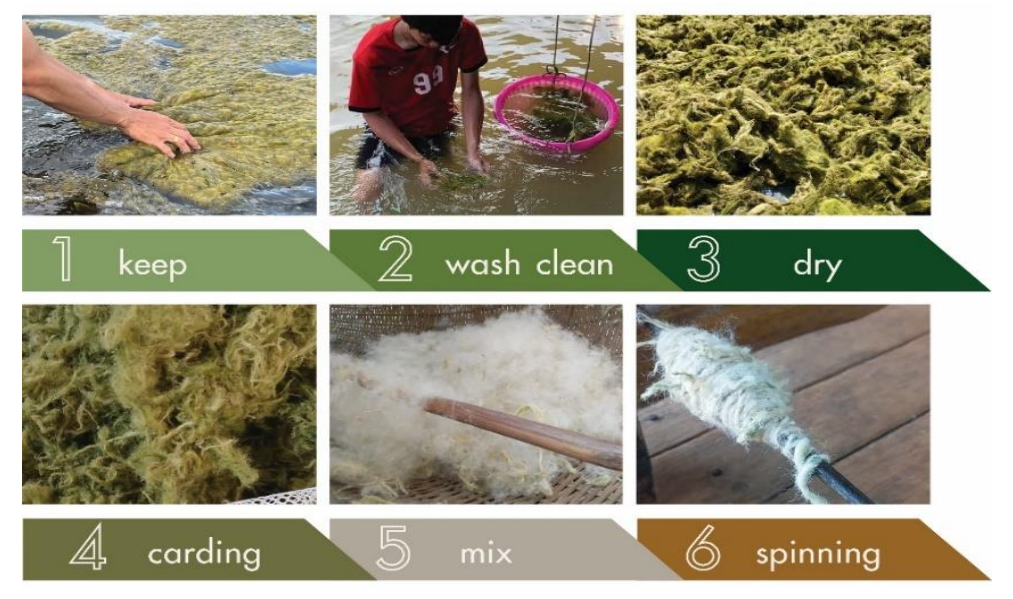
Figure 4 shows the preparation of algae for use.

6) Spun threads by handicraft process. The resulting yarn has the characteristics shown in figure 5.