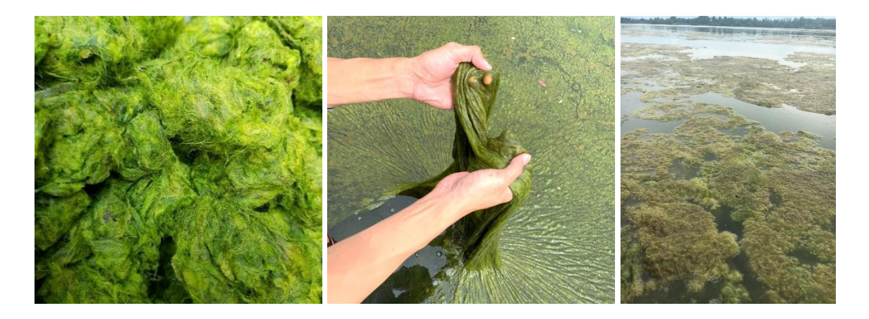
Figure 2 shows the characteristics of algae in shrimp farms

Part 1 Spatial survey and collecting data on algae characteristics and properties in Bang Tabun-Ok Sub-district, Ban Laem District, Phetchaburi Province. It was found that there are 3 types of algae named by the locals as Sarai Pomnhang, Sarai Mama, or Sarai Wunsen, in shrimp farms. By the research, Sarai Pomnhang has the highest amount of fibers. This kind of algae is classified in the group of green algae which contains cellulose as component cell walls. When it dries, it sticks together in a sheet differ from Sarai Mama and Sarai Wunsen that shrinks and becomes crispy. In addition, it was found that this algae grows well in shrimp farms around brackish water ecosystems by adhering to the soil. The physical characteristics of algae in shrimp farms are fibrous, which is similar to human hair. Furthermore, The fibers are also sticky and shiny with light and dark green colors, soft as wool so that the seaweed fibers stick together very well.