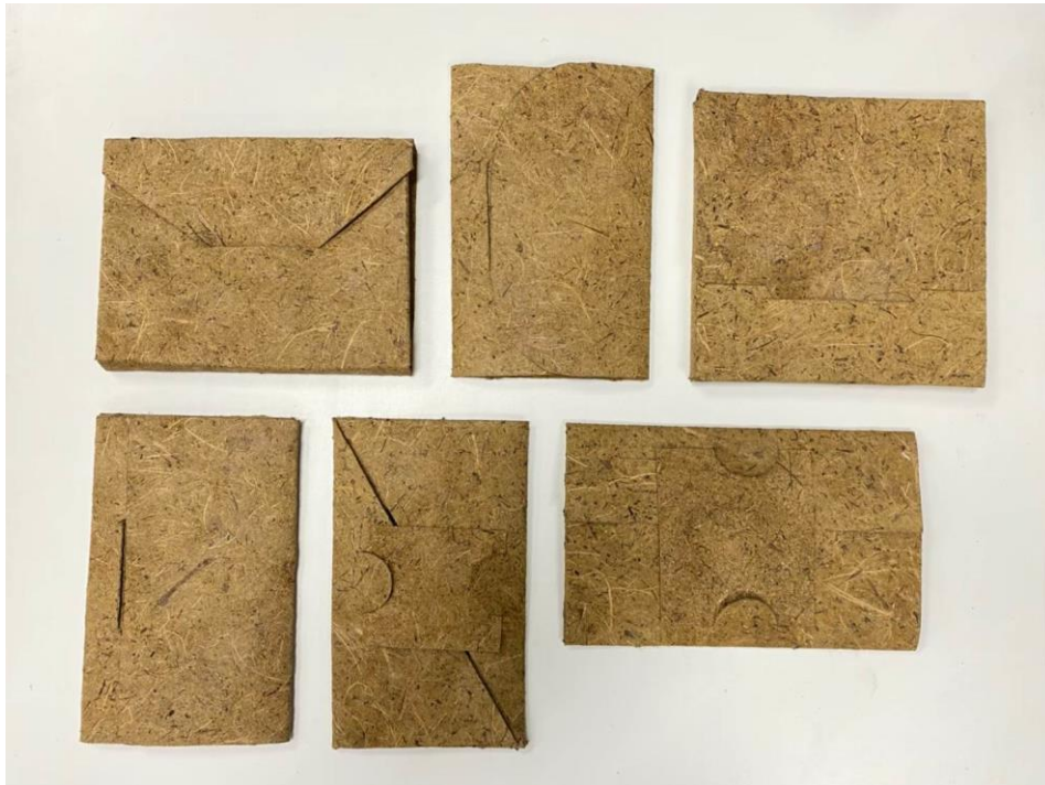
Overall picture of the 6 types of packaging

From in- depth interview in field work study community product of Khiri Wongkot village is a natural dyed shawl with a size of 60 x 180 centimeters. The researcher designed a package for natural dyed shawl from Para rubber leaf paper that fits with its product by concerned about principle of packaging design, attractiveness, production and transportation. There are two essential factors that need to be considered; level of tensile strength and paper size that can be produced. The researcher had designed six types of packaging as below;