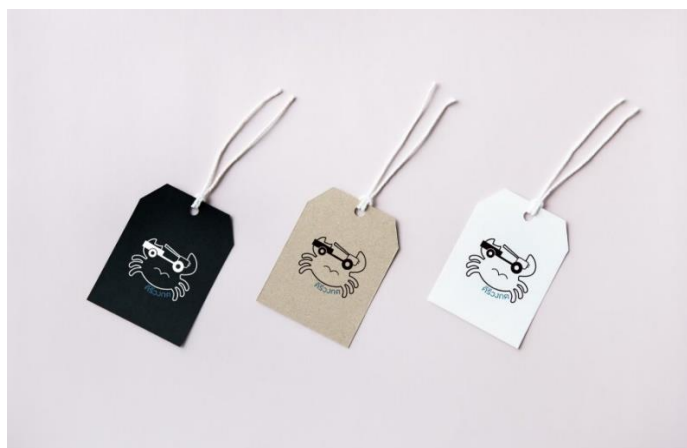
An example of logo usage for Khiri Wongkot village