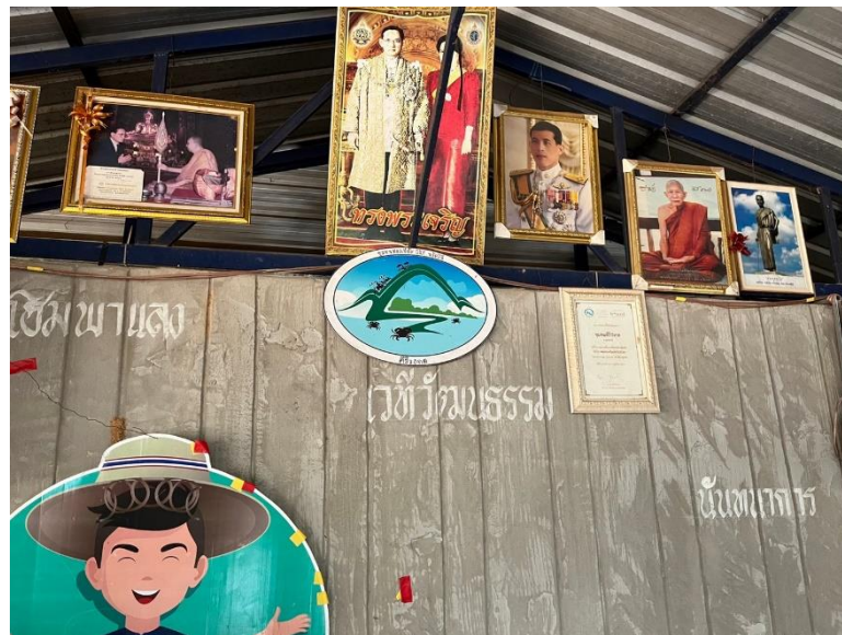
The original image of the community

According to the survey of Khiri Wongkot village, Na Yung district, Udon Thani province. It was found that the identity of the community is ecotourism, new tourism and animal resources. In the past, the community picked up various elements to use as a symbol as the below picture.