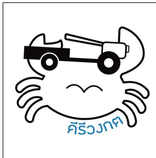
The symbol of Khiri Wongkot village.

After that, the researcher combined a reduced detail symbol together to create a new symbol in order to imply a tourism and local animal of the community.