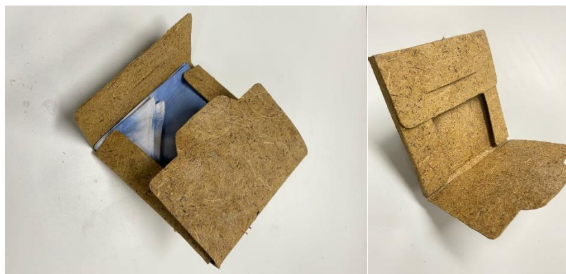
Examples of packaging usage