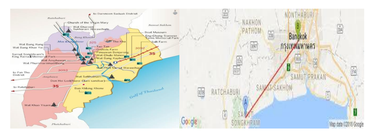
Figure 1 Map of Samut Songkram: Thailand