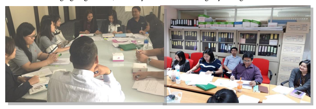
Figure 3 Interviewing experts on this issue.

Studying and searching for knowledge from external sources: the group members search for knowledge on this issue from other universities' website, both public and private universities by focusing on the process and system used for changing of grade "I", then they share this knowledge by telling to other members.