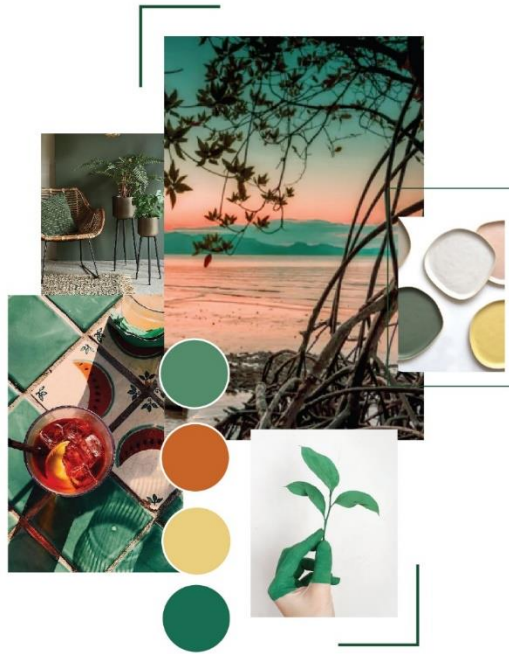
Figure 1 shows the guidelines for creating an image.

Creating an image with diversity from native plants in nutrition in Phraek Nam Daeng Subdistrict, Amphawa District, Samut Songkhram Province is divided into 2 parts as follows: