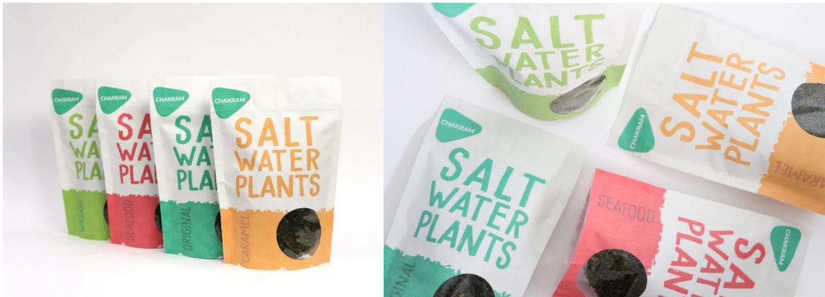
Figure 5 shows the prototype packaging