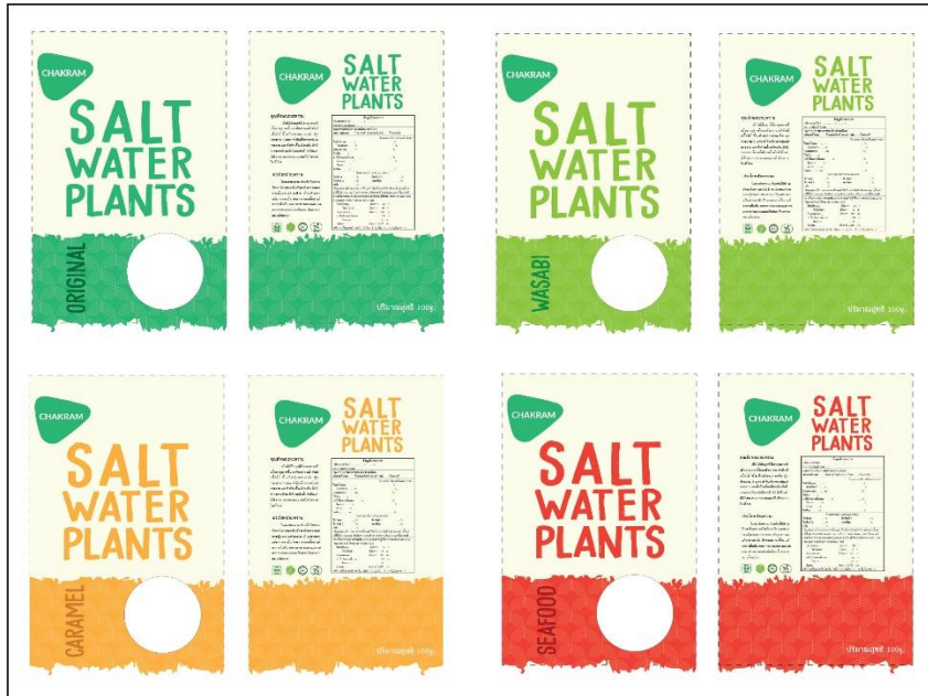
Figure 4 shows the packaging format.