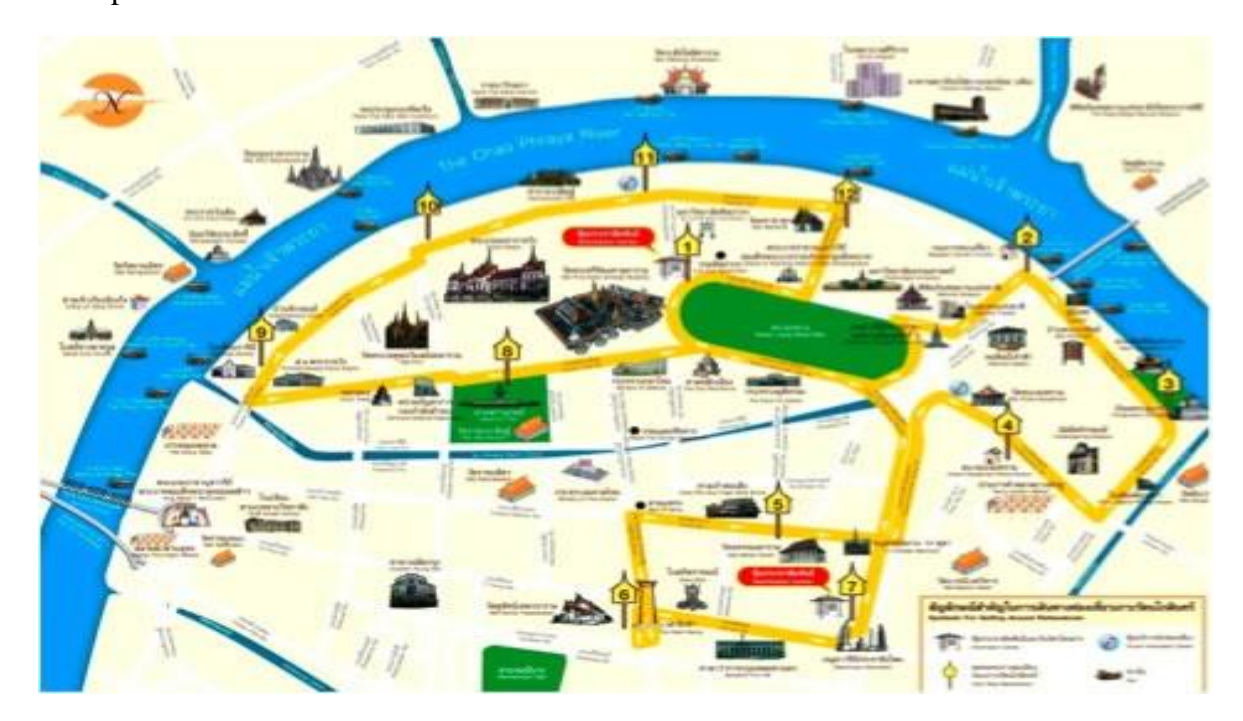
Fig. 6. Tourist attraction map that was benefit from Sanam Chai subway station

Sightseeing Tram around Rattanakosin Island Bangkok Metropolitan Administration provides another atmosphere of sight-seeing which allows you to absorb the history value around Rattanakosin Island. Mon. – Fri. 09.00 am – 04.30 pm, Saturday – Sunday: 10:00 am. – 08.00 pm.