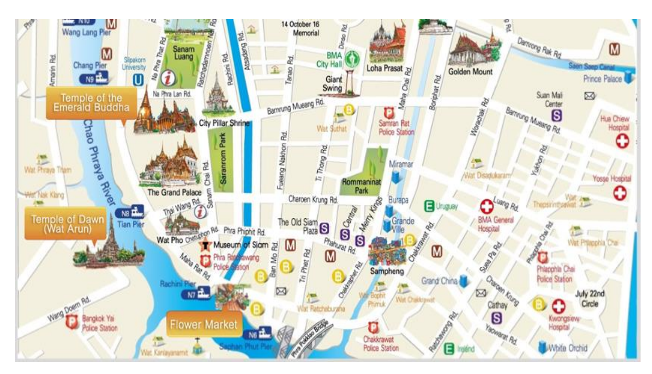
Fig. 5. This station is located in the center of Rattanakosin Island, which is one of the most famous tourist areas in Thailand.