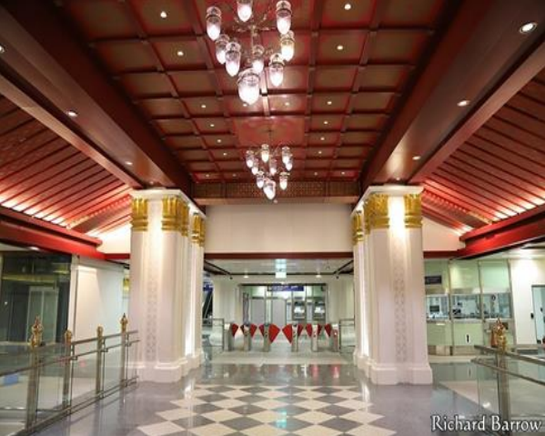
Fig. 2. MRT Sanam Chai's imitated royal court interior is elaborately decorated with ancient-style columns.