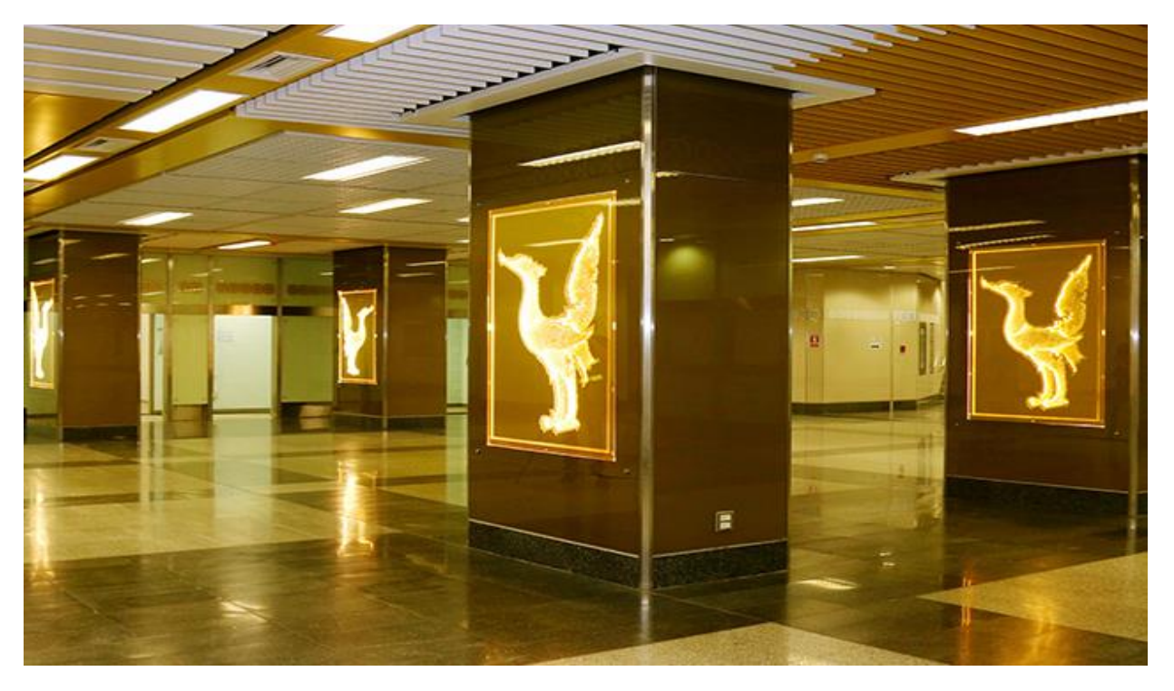
Fig. 4. The esthetic of architectural design created Sanam Chai station to become the most beautiful subway station in Thailand.