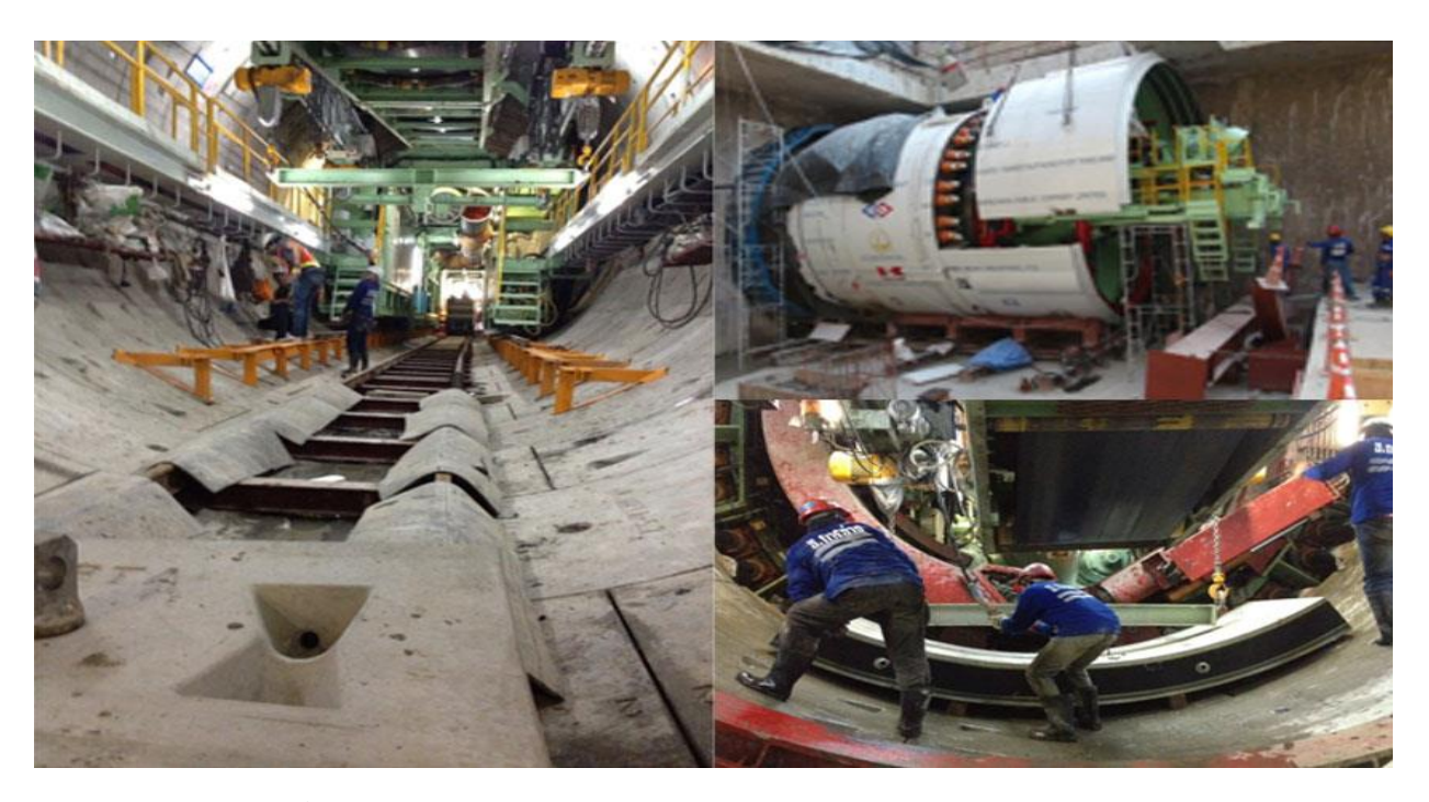
Fig 3. The suway station and tunnel are under constructed.