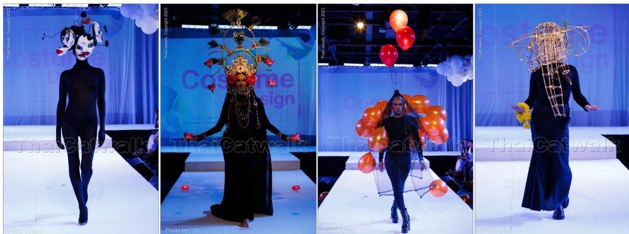
Figure 2: The exhibition of Costume Design Showcase 2023

The second part is the fashion show of Body Painting. There are 38 works of Body Painting exhibition can be divided into three subthemes: Culture, Science Experiment and Extraterrestrial. The first three models are the work of guest artists. Body Painting from a first-year student 105 people, grouped into groups of 3, can produced 35 works. Although the inspiration for creating works came from the brainstorming of students, which each group can present their own interested topics and ideas for designing and presenting. However, the lectures facilitate cross-group discussions among the students to organize and to split the set of works by adding abstract concepts to make the clear distinction between subthemes [8].