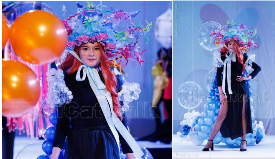
Figure 1: Fantastic Underwater World by Balloon Art Company

between the balloon designers from Balloon Art Company and the student team of body painting. The students design and paint images of sea and underwater world on the balloon dress. This collaboration between experts and students can build professional artist and team working skills for SSRU Theatre. The Costume Design works were classified into four characteristics: Blossom, Culture, Technology and Social Satire, respectively.