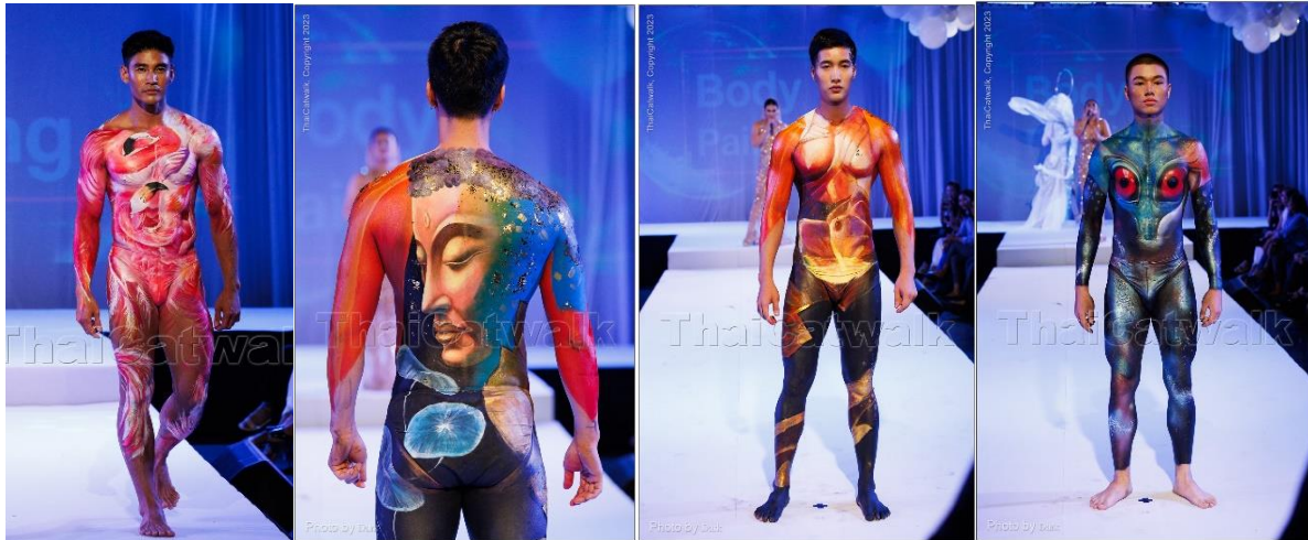
Figure 5: The exhibition of Body Painting Showcase 2023

4. Working with creative and entertainment industries such as 789 Trainee, the use of influencers in the fashion and beauty queen industries including other related media are building a strong reputation for the department and the university.