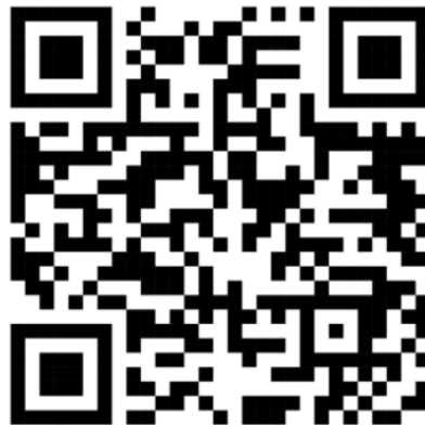
Figure 3: QR code guidelines for writing an English version of a thesis book

The researcher analyzed the problem by questioning students and advisors and found that the thesis examination was delayed because foreign graduate students lack knowledge and understanding. In the format of writing a dissertation, the rules cause the content of the research to be incomplete and the order of arranging the information not organized according to categories. Research is therefore not efficient according to the criteria and causes a delay in learning. The researcher surveyed the collection of research documents that contain knowledge on creating research and guidelines for creating research according to research methods to find relationships and guidelines for developing student research to be effective according to University criteria