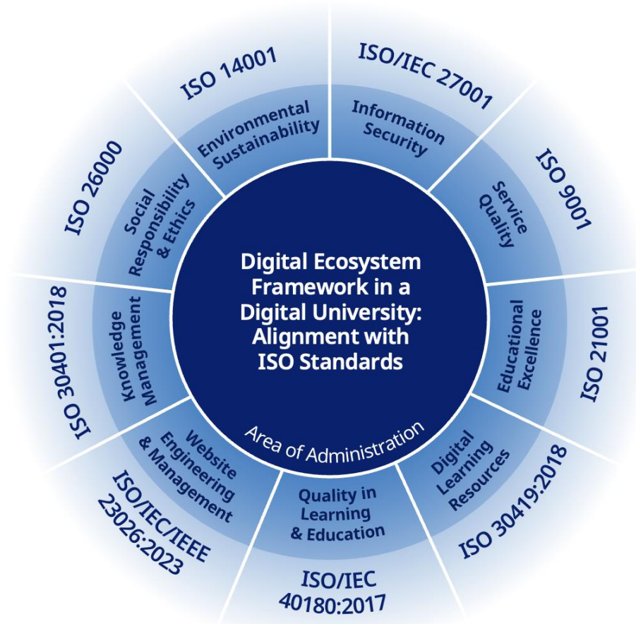
Figure 2. Digital Ecosystem Framework in a Digital University: Alignment with ISO Standards