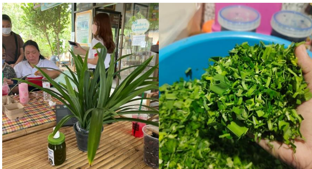
Figure 3-4. Production conditions of pandan leaves

Product processing will be processed into pandan salted eggs. and pandan-scented dishwashing liquid, and has increased the potential of farmers by processing them into pandan-leaf salted eggs. and pandan scented dishwashing detergent