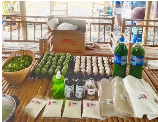
Figure 5. Product development model of pandan leaf agricultural products processing

Supply Chain Management of Pandan Agricultural Products Phutthamonthon District Nakhon Pathom Province, a new model that actually works