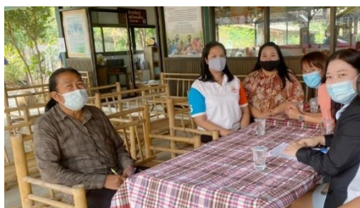
Figure 2. Areas to study the context of farmers

Step D1 O The result was a clearer summary of the problems and development guidelines in some areas from the participation of farmers in the development of product development potential of pandan leaf agricultural products, such as increasing the number of pandan leaves. promotion, processing and packaging development, etc.