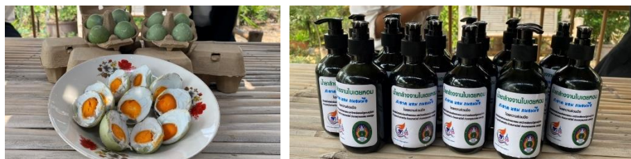
Figure 6. Product development model of pandan leaf agricultural products Processing to make salted eggs and dishwashing liquid with pandan leaves