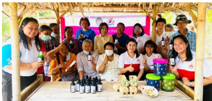
Figure 7. Cooperation in product development of pandan leaf agricultural products in Phutthamonthon District, Nakhon Pathom Province

Therefore, the results of qualitative research and development to enhance local products of pandan leaf agricultural products in Phutthamonthon District Nakhon Pathom Province Farmers focus on and promote new equipment. new to help in product development It has given importance to the innovation management of local wisdom. have the enthusiasm to change in product processing to find ways and forms of pandan leaf agricultural product development and the ability to adapt to different situations in order to create a positive, creative perspective and promote cooperation among farmers in the future