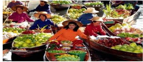
Figure 1. Communities on the riverside.

People pay great importance to the river, as can be seen from various traditions that have been passed down from the past to the present, for example Loi Krathong tradition. From national development especially in agriculture and the industrial sector in the past, including the increase in population, resulting in increased use of water which affects both the quantity and quality of water resources such as reduced water resources for consumption and not suitable for use in consumption, water pollution problems most of which are caused by human activities such as dumping dirt and waste from community sources, Industrial waste water, residue from agricultural chemicals flowing into rivers, canals etc. which directly affects the quality of water resources.