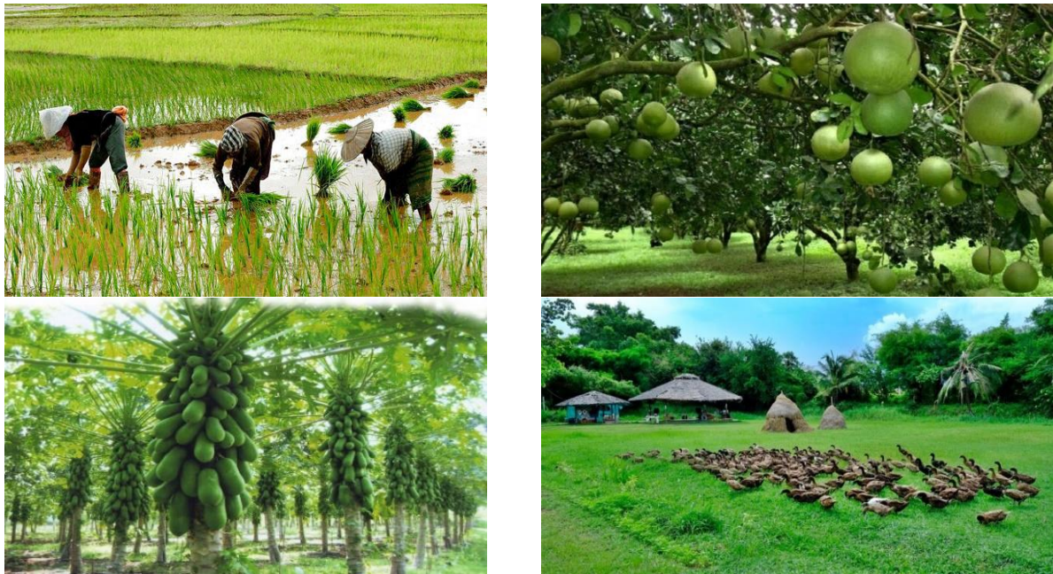
Figure 2. Rai Khing Municipality, Sam Phran District, Nakhon Pathom Province

There is also an expansion of factories, resorts, dormitories, housing estates and communities located in Rai Rai Khing municipality, which may be a major cause of the deterioration of surface water quality, making it unsuitable for use in consumption. Coupled with the geographic factors of the canal style that have inconvenient water circulation may result in a critical condition of the water source and the loss of natural equilibrium.