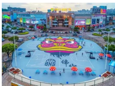
Figure2, Lion Dance Stadium