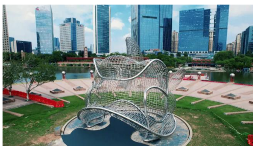
Figure1, Public artwork "Awakening"