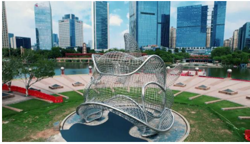
Figure1, Public artwork "Awakening"