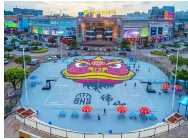
Figure2, Lion Dance Stadium