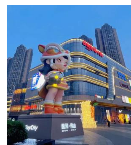
Figure3, Laura-Lion Awakening Sculpture