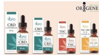
GPO Cannabis oil.