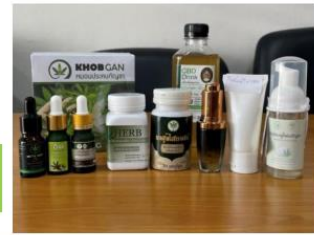
Suan Sunandha Cannabis products

Relaxation and skin care Reduce pain and sleep well