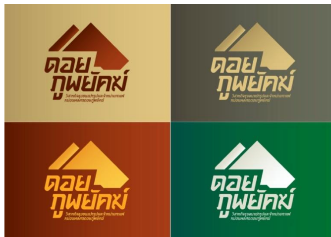
Figure 3 Logo variation on yellow background.