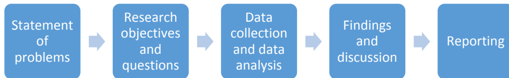
Fig. 1 the Process of Research

success rate of personality development trainings depends on the level of participations with a variety of activities offered. The key work is full participation. The high level of participation rate, the better results of personality improvement of students. Therefore, the researcher is interested in studying and investigating the success of personality development training in the campus of Suan Sunandha Rajabhat University, Bangkok, Thailand.