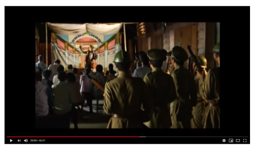
Fig 5 Thai Classical Music and Likay in Thai culture revolution period (http://www.youtube.com/Homrong, 2019)