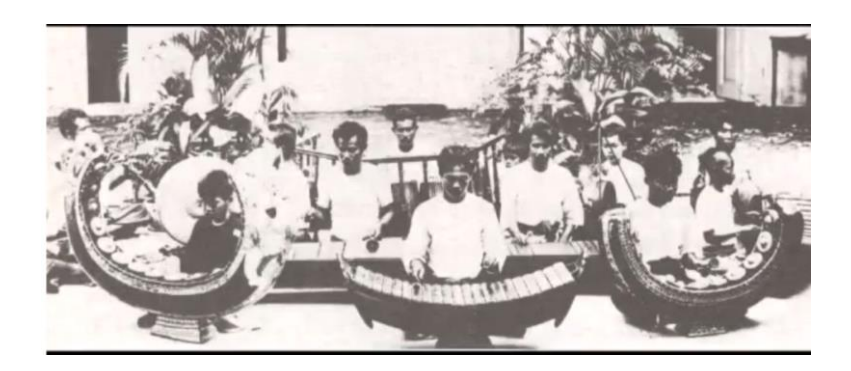
Fig. 1 Thai Tradition Music call "Wong Pipat" (http://www.youtube.com/Homrong, 2019)