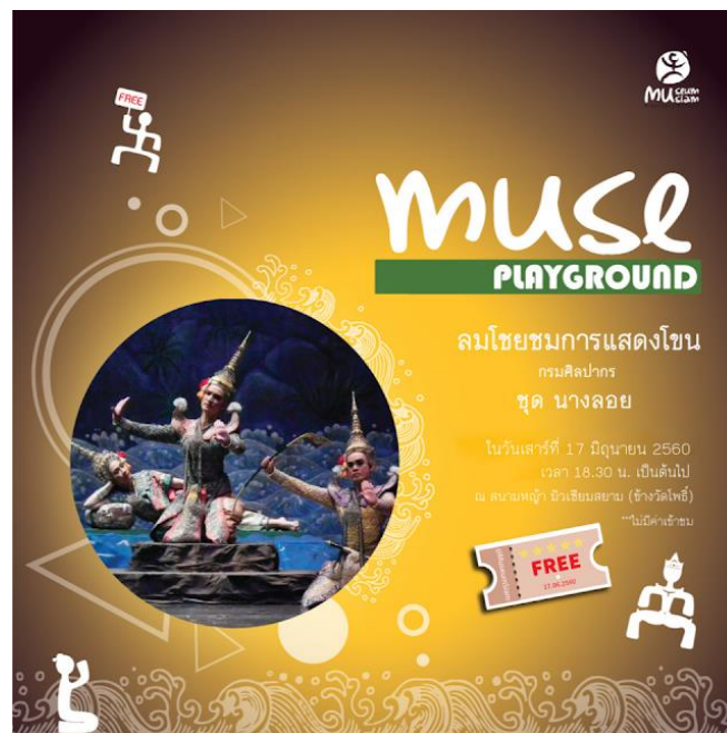
Fig. 1 Khon in Muse poster

( https://boxkao.blogspot.com/2017/06/blog-post_78.html ), 2019.