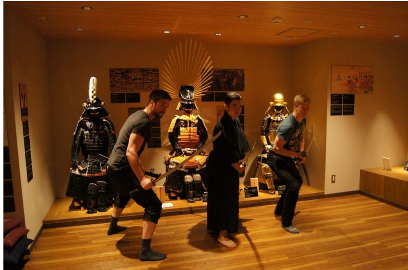
Fig. 2 Weapon Dance in Samurai Museum ( https://matcha-jp.com/th/1736 ), 2019.