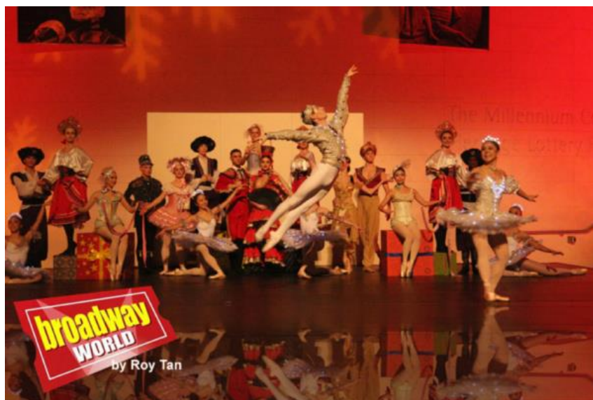
Fig. 3 performing arts in British Museum ( https://www.broadwayworld.com/westend/article/Photo-Flash-First-Look-at-Ballet-Centrals-THE-NUTCRACKER-at-the-British-Museum-20181205 ), 2019.