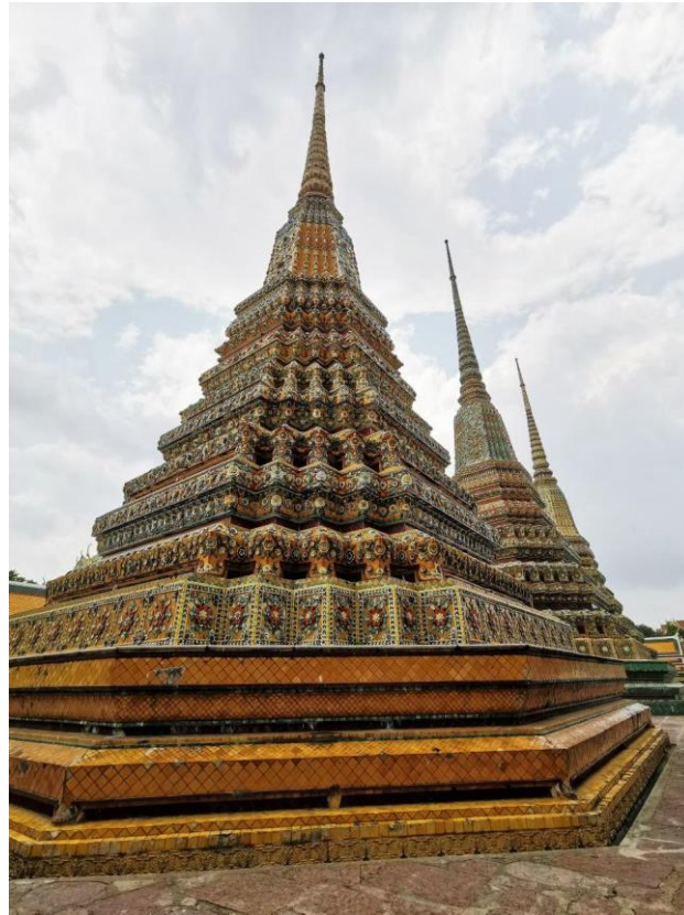
Figure 1: Architecture of the Chedi of Wat Phra Chetuphon