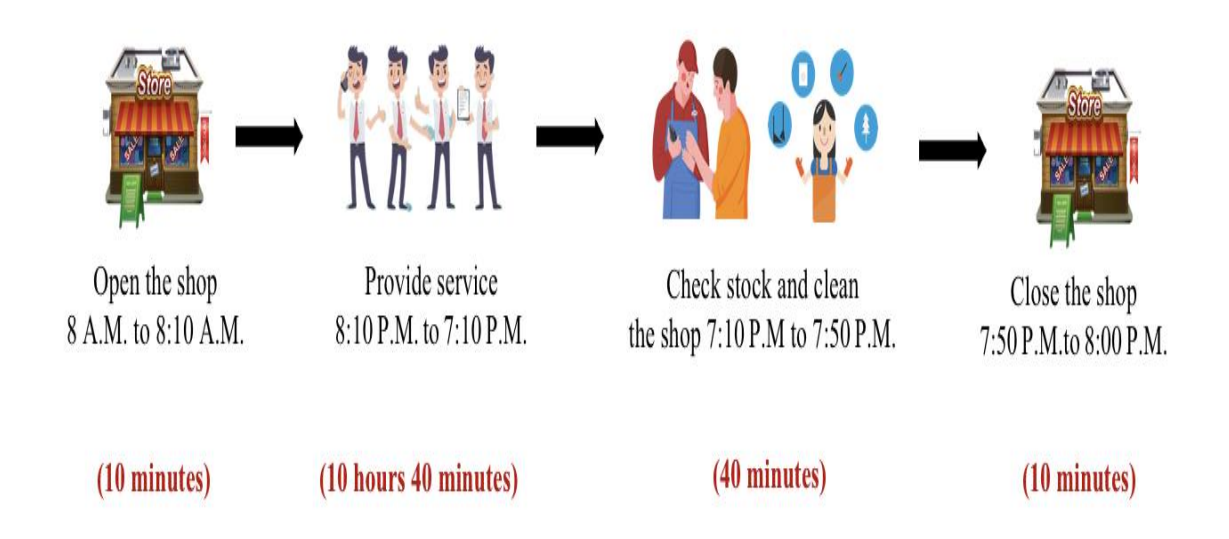
Figure 2: Retail service process after development.