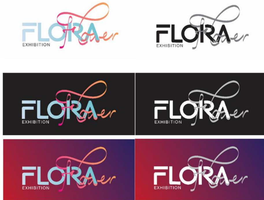
Fig.2. Identity Development Concept for the Flora Flower 2022 exhibition.