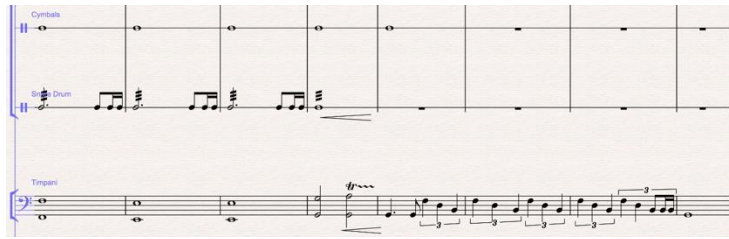
Picture 5: The example of composition of rhythmic part (Krittavit Bhumithavara, Thailand, 2022)

Section 2: For Jeen-Keb-Bup-Pha song, the composer used Bb key in this music. The tempo of the music is 90 bpm. Melody was adjusted to be more contemporary as not based on the original melody. The author performed piccolo for melody and harmonized sound by violin.