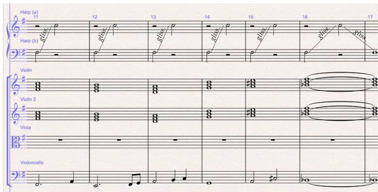
Picture 3: The example of chord progression and harmonizing (Krittavit Bhumithavara, Thailand, 2022)

For the main melody, the composer performed trumpet and piccolo as unison style to be clearer of the main melody as the picture showed below.