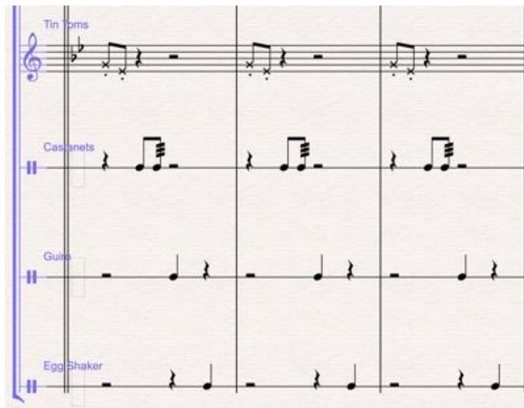
Picture 8: Some examples of using rhythm (Krittavit Bhumithavara, Thailand, 2022)