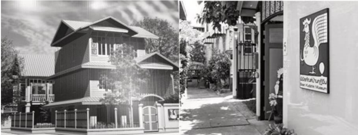
Fig.2 Baan Kudichin Museum, the three-story renovated wooden house