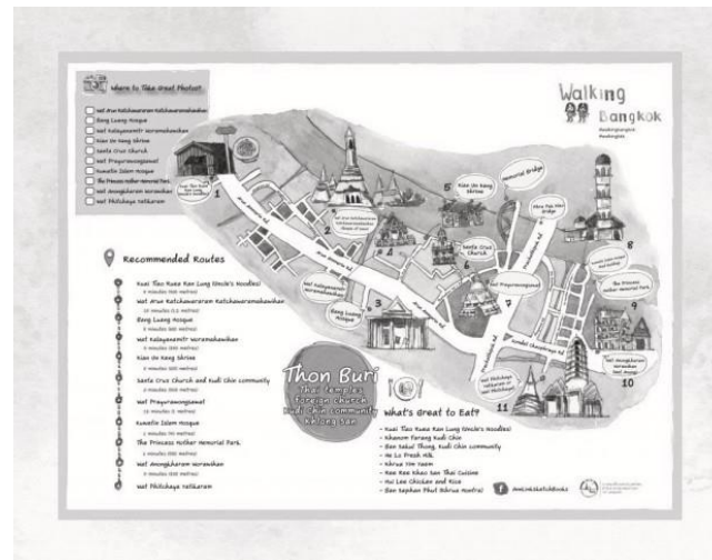
Fig.1 Kudichin sketch map for tourist to visit the riverside multicultural community