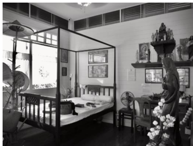
Fig.3 The Old Style Bedroom

Baan Kudichin Museum is the community learning center for people who want to learn about the history and how the mixed-culture community live together well in harmony peacefully