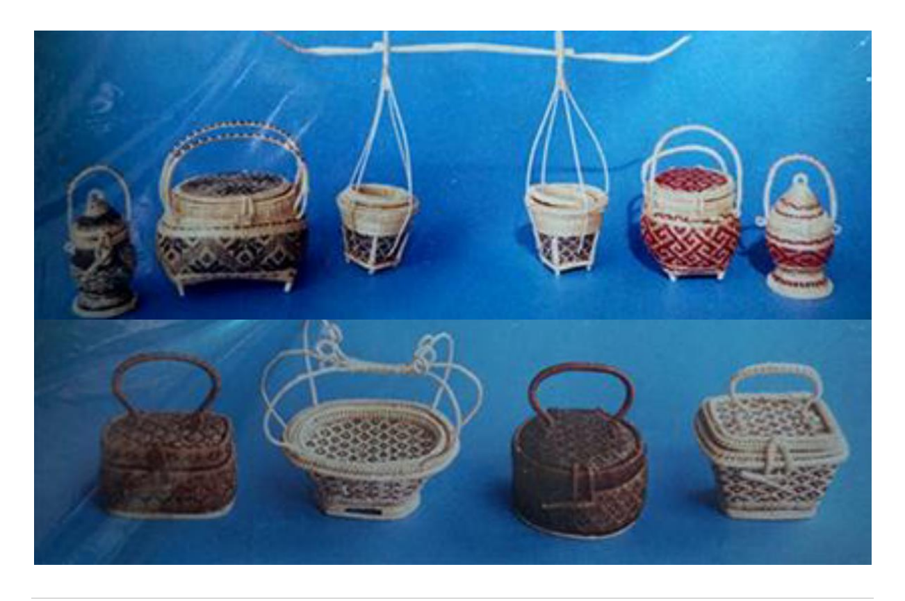
Figure 2 Pranee Handicraft Group's products

From Table 1, it shows that the production processes of basketry work of Pranee Handicraft Group consist of 3 main processes which are material preparation, weaving and maintenance of basketry conditions.