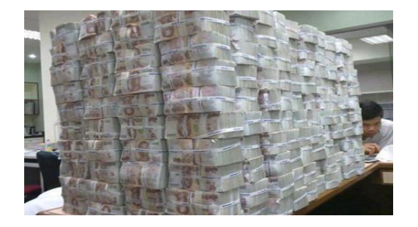
Figure 4 Life Insurance Investment