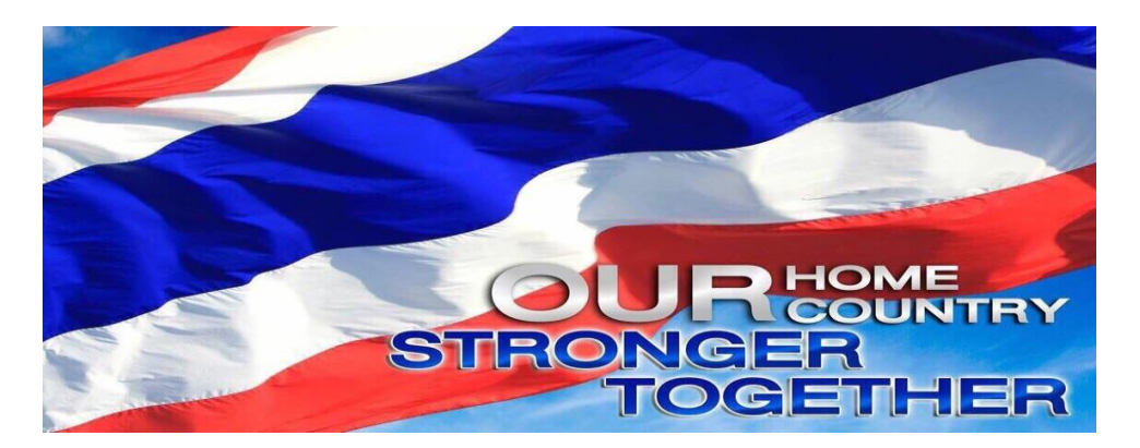
Figure 8 Thailand Motto

According to these results, the approach to saving in Phatthalung, local city in the south of Thailand, applying the concept of sustainable economy found that once the community has developed up to indicate where people were given an opportunity to work and get enough revenue to make a living, the people themselves should emotionally be mature, become forward-thinking or vision, and have a responsibility towards the society. In addition, they must share a common value, a tradition, and an identity, in order to make them feel belong to the community. The people will have an awareness of preserving such manners inherited from prior generations and prior period. Moreover, they will organize a network to share ideas, create a funding plan, and solve problems when necessary, all of which help to strengthen the community. Eventually, a unity will be achieved leading to an ideal peacefulness. It can be described that, a strong economic community is highly capable of dealing with difficulties by itself applying a local knowledge and its social network as major resources. Finally, this type of community tends to be self-reliant in most aspects, depending on others only for a compliment.