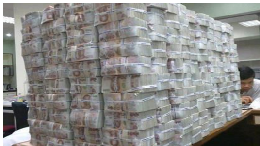
Figure 4 Life Insurance Investment