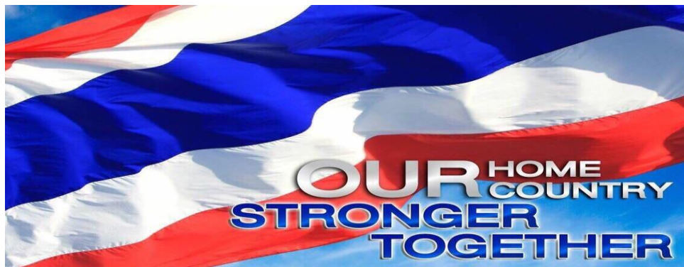
Figure 8 Thailand Motto

According to these results, the approach to saving in Phatthalung, local city in the south of Thailand, applying the concept of sustainable economy found that once the community has developed up to indicate where people were given an opportunity to work and get enough revenue to make a living, the people themselves should emotionally be mature, become forward-thinking or vision, and have a responsibility towards the society. In addition, they must share a common value, a tradition, and an identity, in order to make them feel belong to the community. The people will have an awareness of preserving such manners inherited from prior generations and prior period. Moreover, they will organize a network to share ideas, create a funding plan, and solve problems when necessary, all of which help to strengthen the community. Eventually, a unity will be achieved leading to an ideal peacefulness. It can be described that, a strong economic community is highly capable of dealing with difficulties by itself applying a local knowledge and its social network as major resources. Finally, this type of community tends to be self-reliant in most aspects, depending on others only for a compliment.