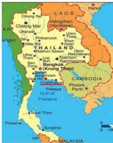
Figure 1 Map of Thailand: Phatthalung