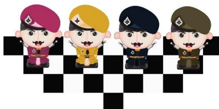
Figure 8 Character and color from Thai chess gameplay comparison for the piece of Pawns or Bei.