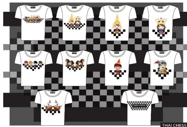
Figure 9 Thai chess character printed T-shirt.

The composition of Character cartoon pattern from entire Thai chess pieces as follows; Khun which is compared to represent the Commander, Emperor, or Empress; Med is compared to represent the Advisor or Guardian or Khun ; Khon are compared to represent the Colonel or Knight chief; Warhorse or Ma are compared to represent the Cavalry or Warhorse ; Ship or Rua are compared to represent the Warship; and Pawns or Bei are compared to represent the infantry in frontline battle. And, moreover, there are additional decorations to fulfill the pattern such as checker pattern to match with created cartoon Character and make it more lively. The T-shirt layout composition is placing cartoon Character in the middle of each T-shirt to emphasize for outstanding and appealing to see the Thai chess cartoon Character clearly. This fashion product prototype of printed Thai chess cartoon Character T-shirt used high quality white cotton T-shirt to print decorations because of its popularity and wearing comfort. Transfer Printing technique, ironing printed paper on the fabric with heat treatment, is used in this study because of specific decoration layout with sharp detail, high printing speed, and low cost that suits for fashion product with low limited budget, figure 9.