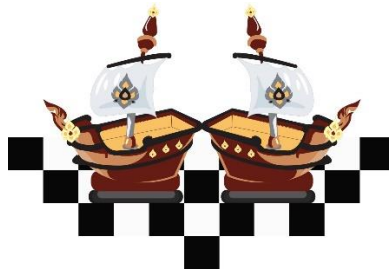
Figure 7 Character and color from Thai chess gameplay comparison for the piece of Ship or Rua.

located one on each of the corner squares on their own side of the board. With its ability and importance, researcher then designed this cartoon character focused on the figure or structure that looks like an Ancient Warship with sturdy sailing mast for swift movement, the main color tone is golden brown like an ancient wood, moreover, Lai Thai patterns are also embossed including Kranok and Prajam Yam decorative to decorate and represent Thai chess identity on the craved prow and mast as well, Figure 7.