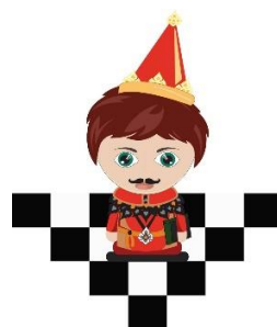
Figure 4 Character and color from Thai chess gameplay comparison for the piece of Med.

Med in the Thai chess board is compared to Advisor, Guardian, or Aristocrat because the position of this piece is on the right side of Khun or simply compared as the support Aristocrat or Strategists to give advices in warfare besides the Khun at the beginning and Queen (Met) moves one square diagonally. Character design focuses on the figure or structure that looks like the Advisor, Guardian, or Aristocrat. This cartoon character is a calm man with wisdom wearing outfit and accessories like ancient Thai Advisor or Aristocrat to present their title. Head accessory is a conic hat like the hat of ancient Thai Advisor or Aristocrat. Outfits color tone is red-orange or ripe bael from Thai color tone which displays the wisdom, decisive, and intelligent; accessories with yellow-gold, silver, and black color represents the state of wisdom in thoughts and power of war tactics. The book on the right-hand side represents an attitude of studying and seeking for knowledges with Lai Thai pattern including Kranok and Prajam Yam decorative to represent Thai chess identity, Figure 4.