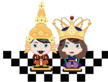
Figure 3 Character and color from Thai chess gameplay comparison for the piece of Khun.

Accessories are in gold color representing nobility and power with Lai Thai pattern including Kranok and Prajam Yam decorative to represent Thai chess identity, Figure 3.