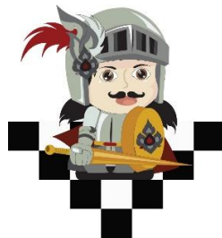
Figure 5 Character and color from Thai chess gameplay comparison for the piece of Khon.

strong and holding golden steel knight sword and shield ready for battles. Head accessory is the steel helmet with silver and red tassel that represents the power and decisive of the knights, decorated with Thai birds' pattern on the side. Moreover, most of color tones used are metallic silver and gold of armor embossed with Lai Thai pattern including Kranok and Prajam Yam decorative to represent Thai chess identity, Figure 5.