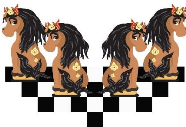
Figure 6 Character and color from Thai chess gameplay comparison for the piece of Warhorse or Ma.

Warhorse or Ma in the Thai chess board is compared to Cavalry; in board game, Warhorse is one of the key pieces because of its longer movement compared with Khun or Med, it moves to a square that is two squares away horizontally and one square vertically, or two squares vertically and one square horizontally. The complete move therefore looks like the letter "L" so there are many advance tactics to play with this piece compared with another one that makes the game more interesting. There are 2 Warhorse pieces in the game located on both left and right side of Khon pieces. Character design focuses on the figure or structure that looks like Destrier or strong warhorse with swift, agility, and readiness ready for battles. The Warhorse figure is in brown color with black hair similar with the real warhorse, moreover, Lai Thai patterns are also embossed including Kranok and Prajam Yam decorative with orange-red and gold color to decorate and represent Thai chess identity on their ears, head, body, and tail as well, Figure 6.