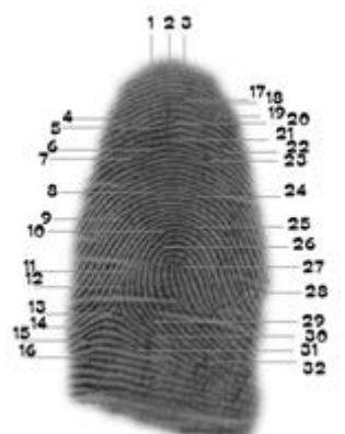
Figure 3 The prototype image of detection on a special characteristic of minutiae

From the experiment to find latent fingerprints that were collected with a black dust powder method and the superglue method is a latent fingerprint that appears on the plastic, then has a clear line pattern that is sufficient to read the 10 special characteristic of minutiae.