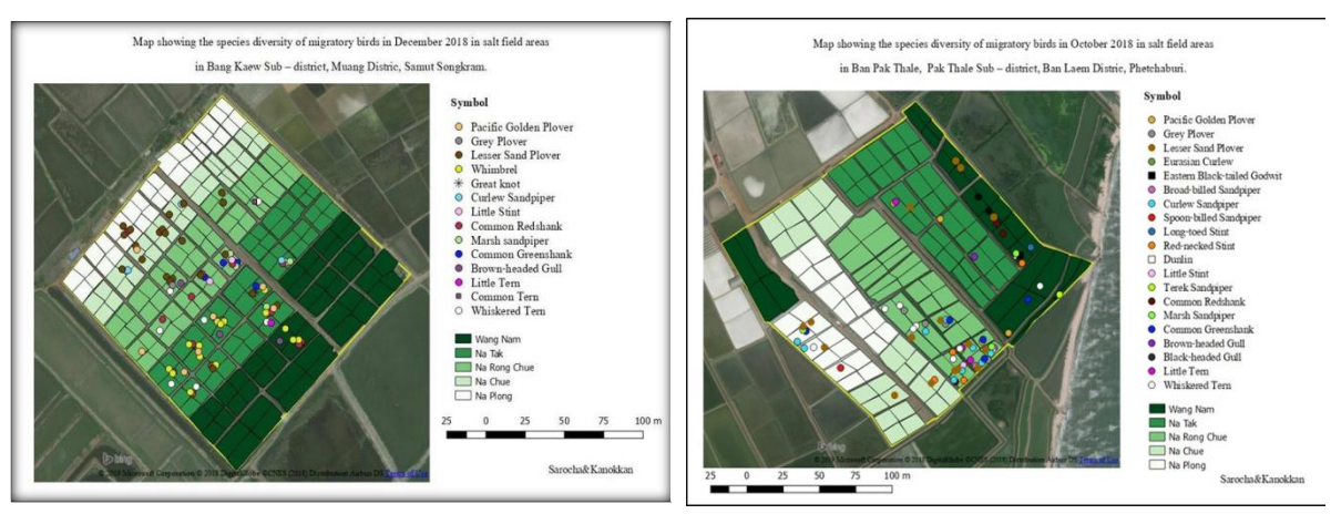
Figure 3 Map showed the diversity of migratory birds in Bang Kaew Sub-district, Muang District, Samut Songkhram Province and Ban Pak Talay, Pak Talay Sub-district, Ban Laem District, Phetchaburi Province from October - December 2018.