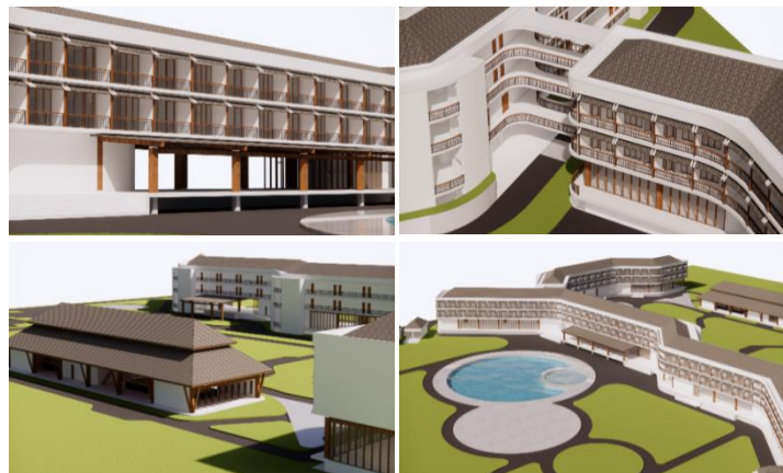
Figure 4 : Building characteristics

Architectural characteristics – The concepts for designing the architectural characteristics are from the characteristics of being Muay Thai; the combination of Thainess, colors, and materials to connect the proportions of two areas.