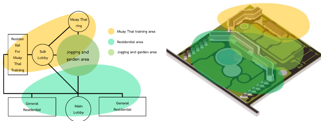
Figure 1: Space layout diagram

Designing areas for relaxation and practicing Muay Thai will separate 2 areas; the residential area and the practicing Muay Thai area with similar proportions.